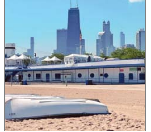
The driver of an SUV ran over a woman during an altercation at North Avenue Beach on May 16, according to Chicago police.

On Memorial Day weekend in 2022, police arrested nine men for trying to bring guns through a security checkpoint at the beach. The following month, a man was shot in the face, and three police officers were injured while trying to restore peace at the beach. While CPD released surveillance images of the