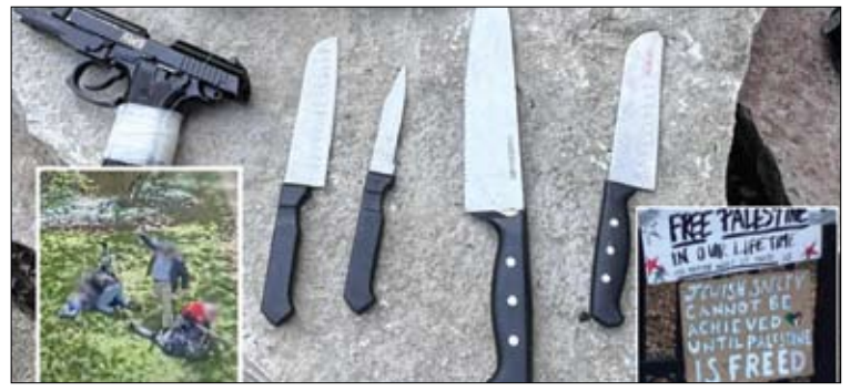
Some of the images DePaul Univ. posted to support its decision to clear the quad encampment on May 16.

Other images posted by the school show bike locks allegedly placed by protesters on library doors, barricades erected, and infrastructure removed.