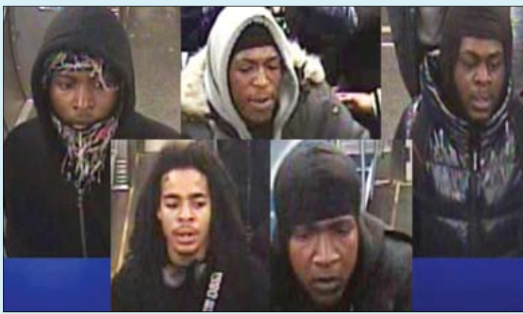
Police are seeking these five men in connection with a robbery on the Red Line downtown.

So far this year, four people have been shot in Uptown.