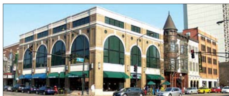
In play in the Old Town rezoning chess game is the Piper's Alley complex [above], including the X-sport Fitness Club, Starbucks, Second City Theater, and more than a dozen commercial properties that ring the northwest corner of North and Wells.

It also includes the Piper's Alley tract, owned by Old Town Development Associates, LLC, a