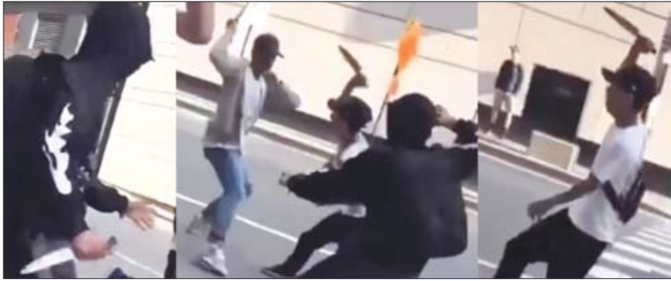
Video images show at least three men armed with knives during a confrontation along the Magnificent Mile on May 19, 2024. No injuries or arrests were reported.