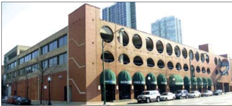
Residents and building owners in the old Town Triangle landmark historic district are overwhelmingly against a proposed 44-story old Town Canvas monolith. Now, they say they have another battle to fight in the proposed high-rise war developing in Piper's Alley [above].

about the anticipated vehicular traffic that can be reasonably anticipated from the rezoning of the Piper's Alley parcel, or the proposed 500-unit apartment tower at 1610 N. LaSalle.