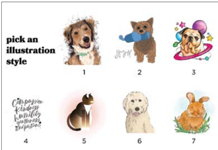
Receive an adorable custom pet portrait by Design B&B when you donate to Humble Design.

back into homelessness within one year of securing housing. But 99% of Humble Design's families are still in their home after a year. Since opening its doors in Chicago in 2017, more than 600 people now have a housing stability that gives them time to focus on their education, careers, home life, dreaming and planning for the future.