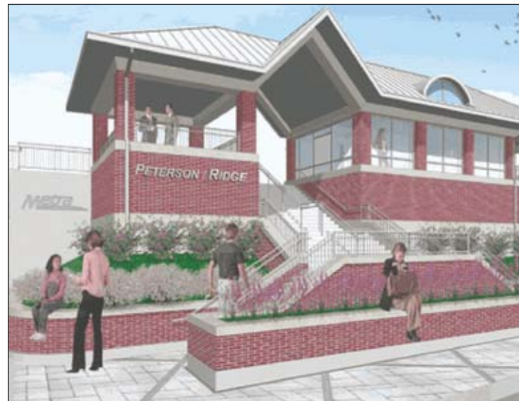
Artist rendering of the Edgewater Metra Station project. The $15 million project is scheduled to be completed in spring 2022.