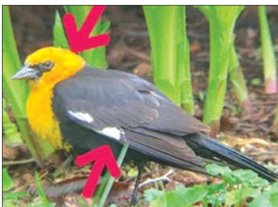
A Yellow-headed Blackbird.

But during the severity of the pandemic, no tourists have come near. Months of solitude and quietude have suddenly allowed the spring to bloom. And without the crowds of visitors, marching all around, a small pink wildflower has been allowed to flourish and thrive amid the basalt pillars. An ancient, Bronze age wild garden