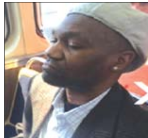
Suspect being sought for sexual indecency aboard the Brown Line.

Chicago police issued a community alert after two women reported a man behaving indecently on Brown Line CTA trains over the past 10 days. Both women are pregnant. The women told police that the man pictured here began masturbating near them as they rode trains in Lakeview and Lincoln Square during afternoon hours. The first case was reported around 3:15 p.m. May 8 by a woman who said the incident occurred while riding near the Montrose station. Two days later at about the same time of day, another woman reported similar behavior as the train moved near Southport. This newspaper previously reported that the first victim told police that the man followed her from the train when she exited at the Western stop. He then walked away in an unknown direction. Police describe the offender as a black man between 40- and 50-years-old who stands about 6' tall. Anyone with information about the suspect is asked to call detectives at 312-744-8200.