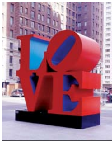
Robert Indiana's iconic LOVE sculpture