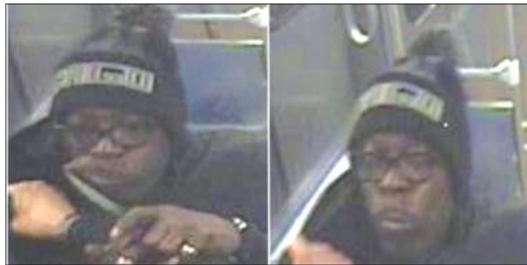
Police are seeking this man in connection with a stabbing and attempted robbery aboard the Red Line.