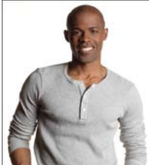
Dr. Ian Smith is challenging Chicagoans to "Go Clean" for 20 days, starting June 4.

"People think that eating clean means having to buy expensive food, having to shop at multiple gourmet stores or that you are going to only be eating like a rabbit. Not the case," said Dr. Ian. "The Clean 20 shows people that you can eat clean on a limited budget, have plenty of food to eat, and have fun while doing it."