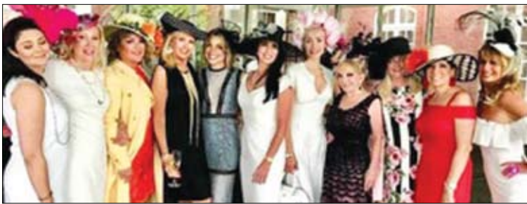
Service Club Ladies and their hats.