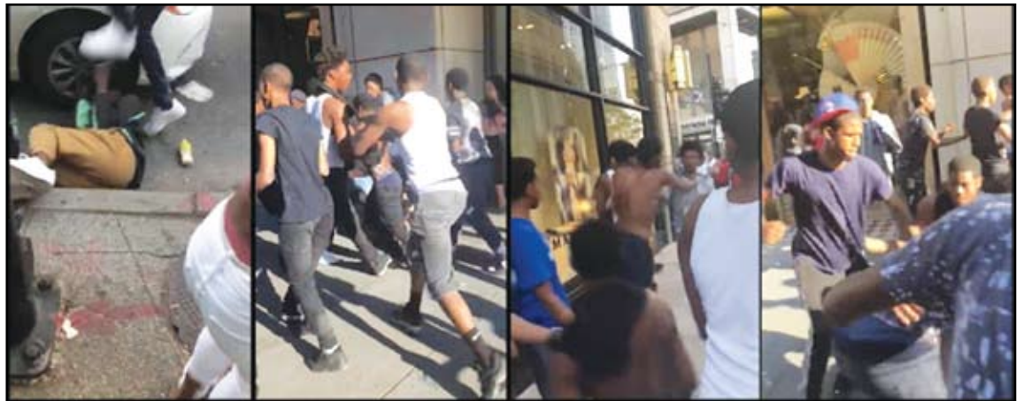
Mobs of violent youths overwhelmed Chicago Police again over the Memorial Day weekend, causing trouble on the Mag Mile, River North, and Streeterville. This latest mob action comes less than a month after similar mob actions were reported downtown that saw police overwhelmed by the large numbers of offenders.