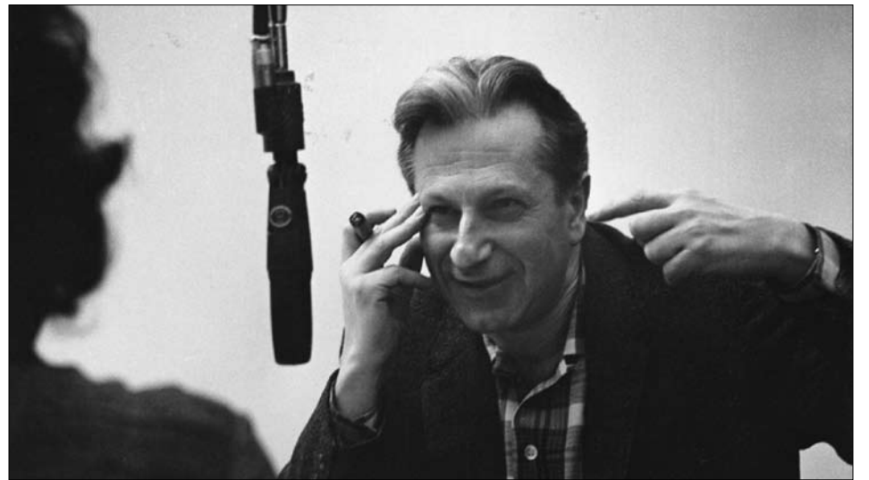
Studs Terkel