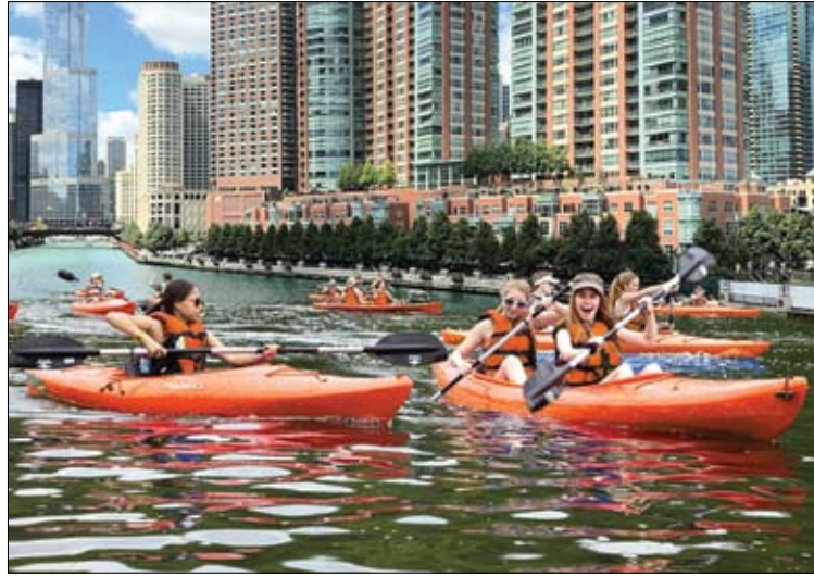
Free kayak tours for people with disabilities are now available through hourly kayak rentals and guided, two-hour adventures from Bobby's Kayaks, which opens June 16 at the ADA accessible Ogden Slip at 465 N. McClurg Ct.

People with disabilities who bring a non-disabled partner to ride with them in a tandem kayak can enjoy a kayak tour for free; the non-disabled partner pays a nominal fee to cover the cost of staff needed to supervise the trip. The kayak rental fee will be