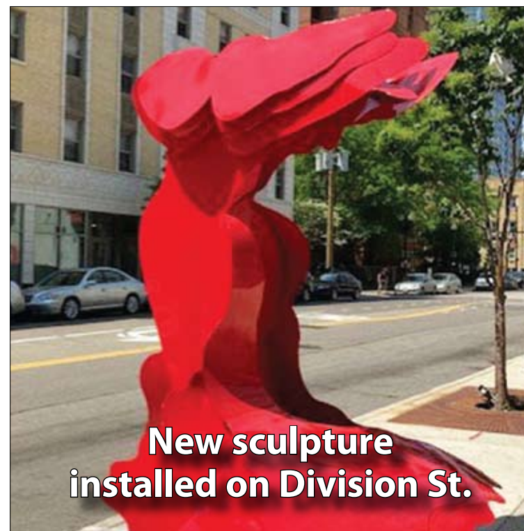
New sculpture installed on Division St.

A giant new sculpture has been installed on the corner of Clark and Division St. in the Gold Coast.