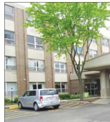
Elevate Care at 2451 W. Touhy Ave.