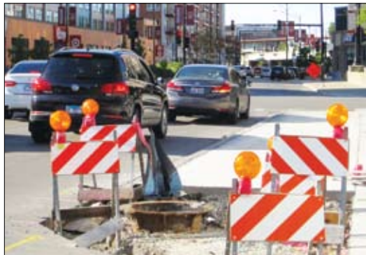
(Left) The intersection at Broadway-Devon-Sheridan will have bump outs installed to shrink the roadway and make the area more walkable. This will also help slow traffic as it approaches the intersection. (Right) The Toyota building at Broadway and Hollywood was demolished to prepare for the CTA Red and Purple modernization program. Construction equipment now occupies the space.