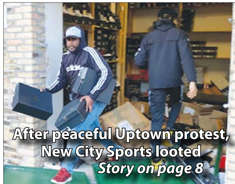
After peaceful Uptown protest, New City Sports looted Story on page 8