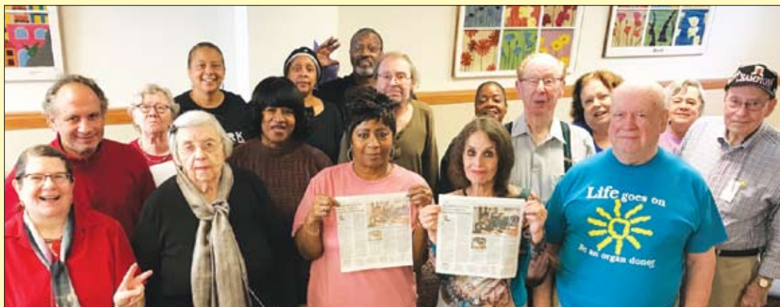
Residents of the Levy House in Rogers Park celebrate a hard fought two-year victory to stay in their homes. Their building at 1221 W. Sherwin Ave. will remain low income affordable housing.

IDA has published resources to help connect older and disabled Illinoisans with family and loved ones to prevent distress and feelings of social isolation. The state is hoping to ensure that services provided by the agency are not interrupted during COVID-19. For more information visit www.illinois.gov/aging or call the Senior HelpLine at 1-800-252-8966 (hearing impaired call 888-206-1327) or by email aging.ilsenior@illinois.gov .