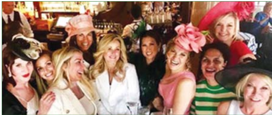
Memories of laughter and good times at Gibsons after The Service Club luncheon at Gibsons Bar & Steakhouse.