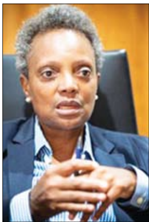
Mayor Lori Lightfoot

However, the rent usually is quite affordable, sometimes only $500 or $600 a month in some neighborhoods. Even in affluent neighborhoods such as Old Town and Logan Square, garden apartment rents typically are 25% to 30% less than above-grade units in the same building.