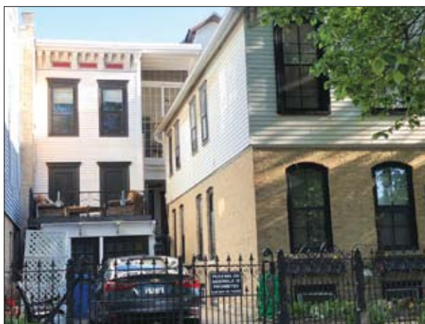
Proposed zoning-code changes would define new living spaces within attics and basements as “conversion units” and spaces in accessory structures as “coach-house units.”