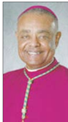
Archbishop Wilton Gregory.

AD MULTOS ANNOS: Cheers to Washington DC Archbishop Wilton Gregory, a beloved South Side native and a Chicago priest, whose long career as an articulate national religious leader turned blisteringly provocative in his castigation of President Trump for his shoddy photo op at Old St. John Church and his misguided visit to the St. John Paul II Center. Gregory promises to be America's first African American cardinal soon. Beloved of Pope Francis. His