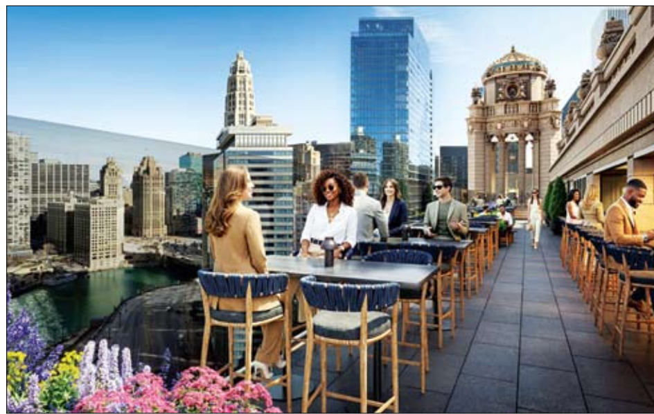
A new restaurant and bar on the 25th floor rooftop of 35 E. Wacker, also known as the Jewelers Building, will offer reservations for the two cupolas that overlook the Chicago River.

When the new restaurant opens, it will mark the fourth Portillo's restaurant in the city limits and the 45th restaurant in the greater Chicagoland area. For more information, visit portillos.com/michiganave/ .