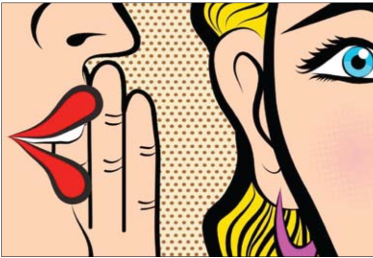
Gossip Girl is a blogger whose true identity is never fully revealed. Her true identity is revealed in the television series finale.

Gossip Girl's teens are precocious and reflective of generations of self-made ancestors of very questionable ethics over the course of America's economic development. Bright but pugnacious, no polished probity or balanced moral rectitude. One minute they're swilling Champagne and eating foie gras on toast in their limousines, the next minute