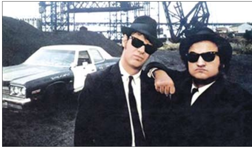
Dan Ackroyd and John Belushi.

Mail a check to: 6221 N. Clark St., Chicago, IL 60640