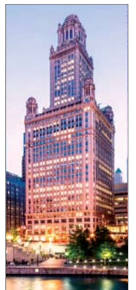
(L) Rendering of a private dining cupola. (R) Jewelers Building at 35 E. Wacker.

taurants and bars – an all-day bar in the ground floor lobby, a fine-dining restaurant, and a 25th-floor rooftop restaurant and bar overlooking the Chicago River.