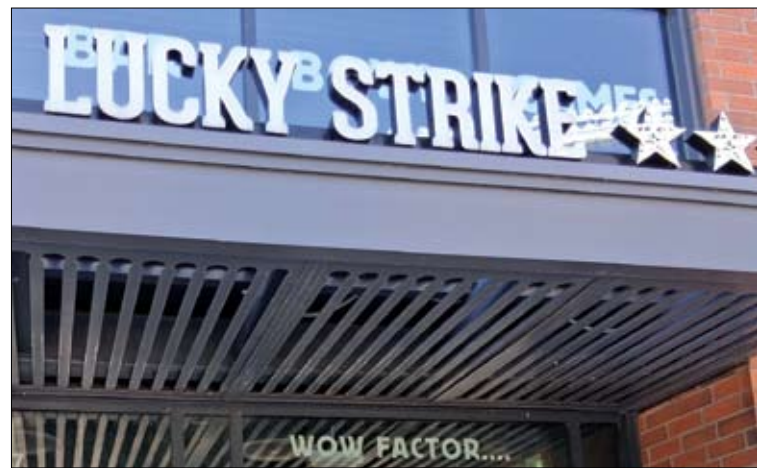
Lucky Strike Wrigleyville, 1027 W. Addison, has permanently closed.