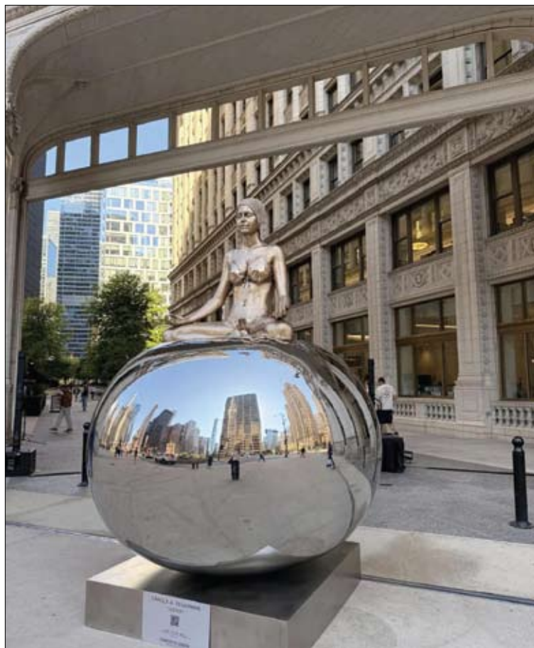
(Top) Brooke with Beach Ball. (Bottom) Justice by Carole Feuerman.