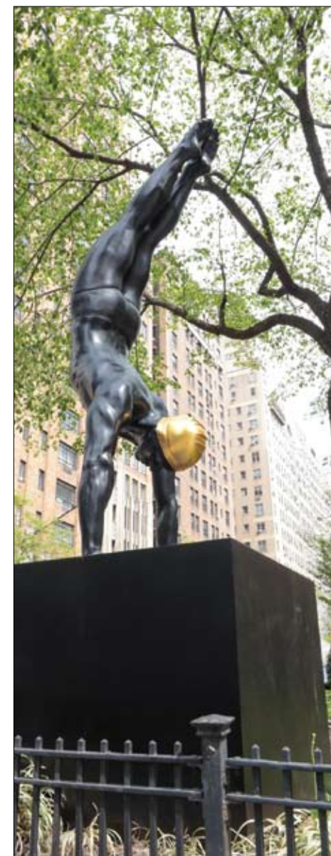
The Golden Mean by Carole A. Feuerman. Courtesy Hilton Contemporary