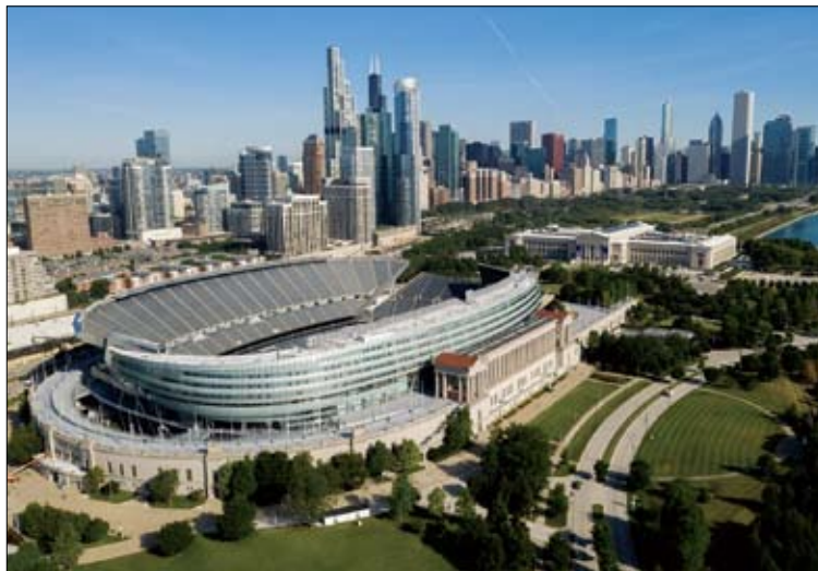
The Bears current lease at Soldier Field is set to expire in 2033, though they may choose to terminate the agreement early and pay a penalty fee.

The 2002 overhaul originally cost $632 million with $200 million contributed by the Bears and