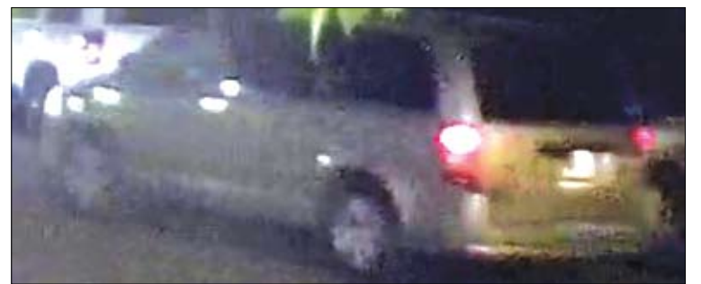
The suspect's vehicle was near the scene of the crime.

Extra security has been added to LVHS entrances to disrupt the flash mobs before they happen.