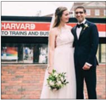
Ivy League wedding.

about the injustice of it all, stop and read the wedding announcements in the Sunday New York Times, that should sprinkle some resolution into the story.