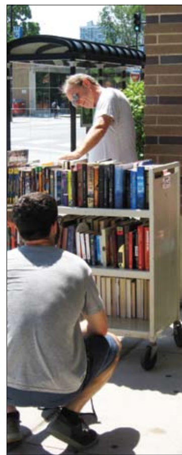
Book lovers will want to stock up at one or more of the used book sales this month sponsored by a local Friends of the Library.

Friends of the Rogers Park Library will conduct its sale on June 29 from 10 a.m. to 4 p.m. The library is located at 6907 N. Clark.