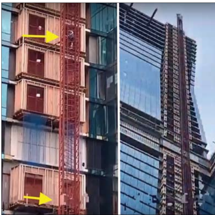
Witnesses said the two climbers reached at least the 72nd floor of the 93-story, 1,198-foot Vista Tower before turning around and working their way back down.

Callers began reporting the climbers, and the 911 calls kept coming as the men came into view of residents in nearby high-rises. Witnesses said the men reaching at least the 72nd floor of the 93-story 1,198-foot project before turning around