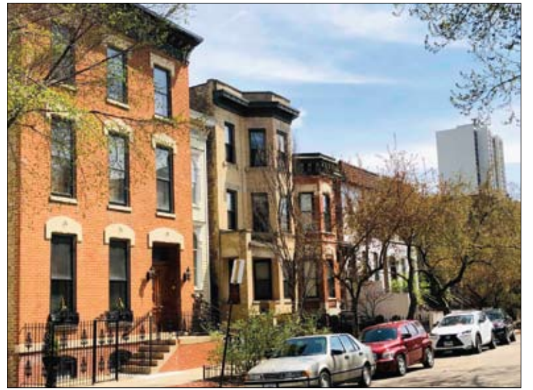
Old Town and Lincoln Park aren't the only neighborhoods that were whacked with sharply higher property tax assessments. Most of the North Side has seen their property taxes dramatically rise.

However, the assessment level is still up a whopping 71.6% after the successful appeal. The 2017 real estate tax bill on the building was $21,981. The 2018 first installment of the bill was $12,089. The owner expects bill rise substantially when the second installment is due Aug. 1.