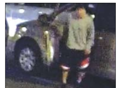
The perpetrator is described as a male in his mid-20's who stands about 5'-10" tall and has a small build.

second incident may be relayed to Area North detectives at 312-744-8261. The case number is JC-276138.