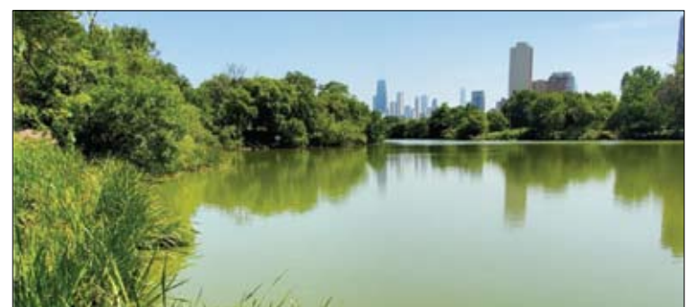
The nine-acre North Pond is a stop-over and residence for birds.