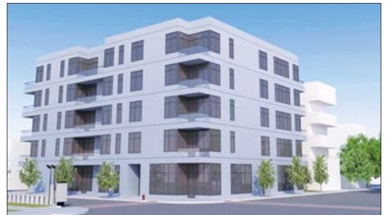
The Irving Oakley Apartments proposed for 2256 W. Irving Park Rd.

Rendering by Sullivan Goulette & Wilson-Architects