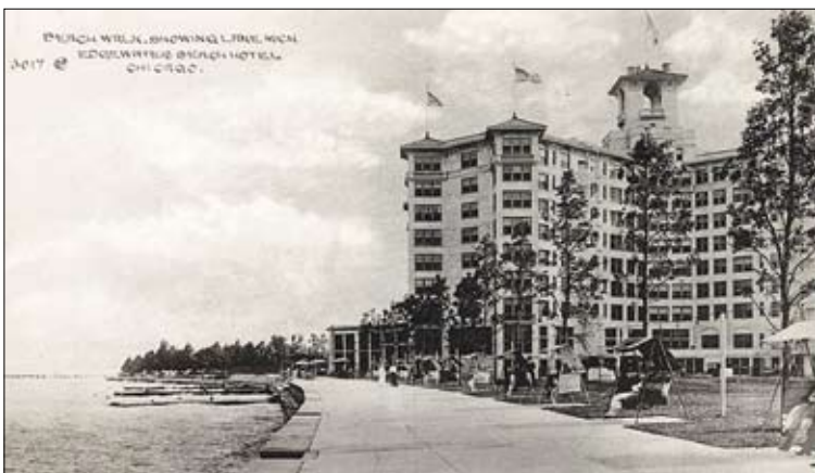
The Edgewater Beach Hotel opened in 1916 and was enormously popular from day one.