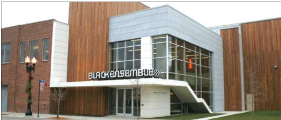
The National Assoc. of Black Theatre Building Owners, including the Black Ensemble Theater, 4450 N. Clark St., will work to ensure the sustainability, longevity, and growth of the Black Theater Movement.

In the 1960s, the Black Arts Movement prompted the need for culturally specific institutions dedicated to providing consis-