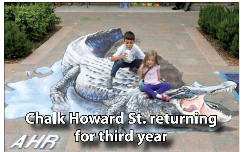
Chalk Howard St. returning for third year