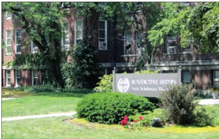
The Benedictine Sisters of St. Scholastica Academy are seeking a zoning amendment for part of the property at 7416 N. Ridge to permit construction of a senior independent living center for its sisters and area seniors.

housed about 200 nuns, but in recent years, the number of nuns living at the campus has aged and dwindled. Today the average age of the residents is in the low 80s.