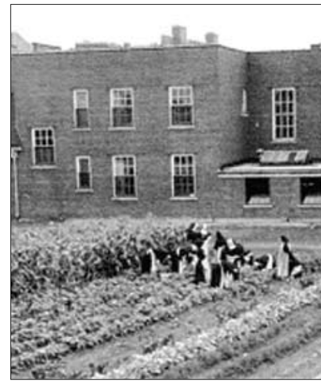
Sisters tend a WWII Victory Garden.