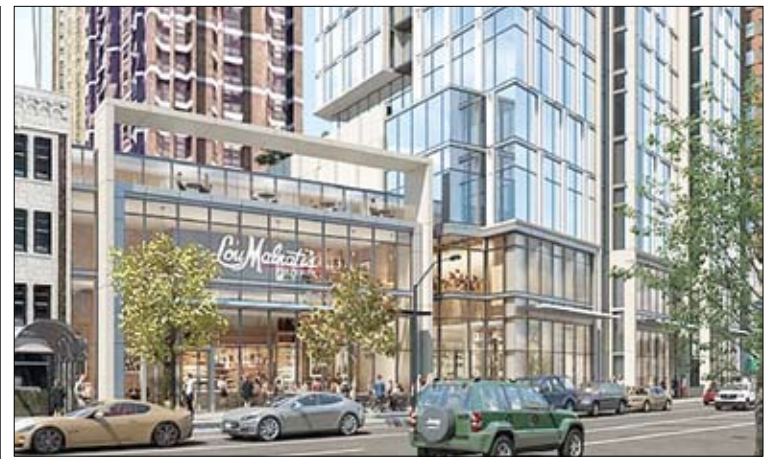
A community meeting will take place 6 p.m. Wednesday, June 23, to address a revised proposal for 1120-30 N. State St., in the Gold Coast.