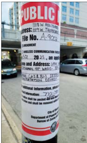
This upzoning notice on Granville refers to sites on Hollywood, Thornedale, and Rosemont.

The city's new effort will allow for greater height and density along the Broadway corridor. Estimates have suggested that new developments may bring upwards