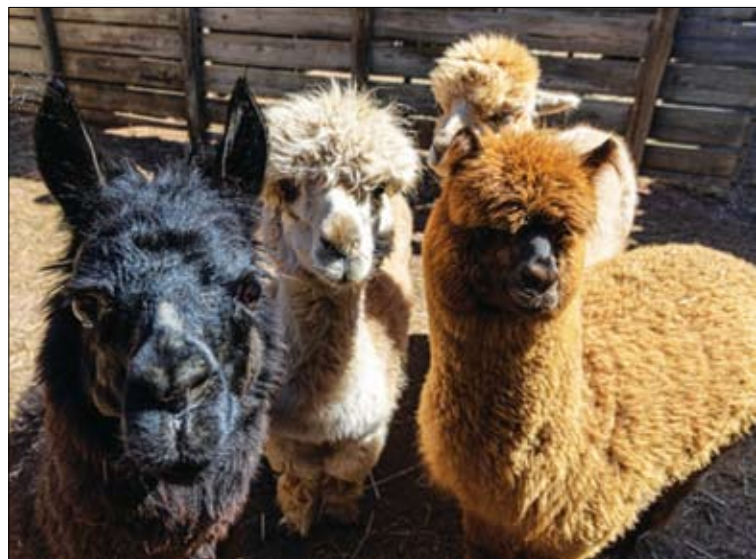
This is the first time since 2019 that there have been alpacas at the Lincoln Park Zoo.

This is the first time since 2019 that there have been alpacas at the Zoo. The species is known to be gentle and social, with a full roster of vocalizations ranging from a droning hum to an alarm call used to alert the rest of the herd