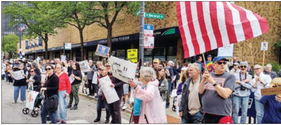
Supporters of the No Kings Day of Defiance lined the 5300 block of N. Sheridan Rd. on June 14. More than 1,800 No Kings rallies took place across the country.