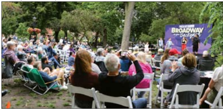
The audience enjoys Broadway in your Backyard at Washington Square Park, in 2024.