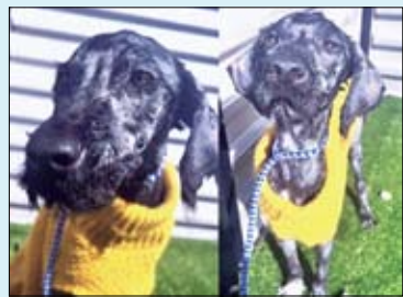
Photos of Betty.

The doctor accused of nearly starving her dog to death—a sickening crime discovered only because a work crew happened upon the malnourished dog inside a tote bin during a clean-up assignment—was sentenced to probation June 12.