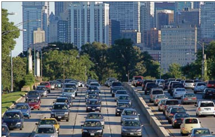
A new city law intended to reduce motorcycle noise on Lake Shore Dr. mimics a state law that allowed the city to install monitors along Lake Shore Dr., similar to those used at O'Hare, to measure noise levels.