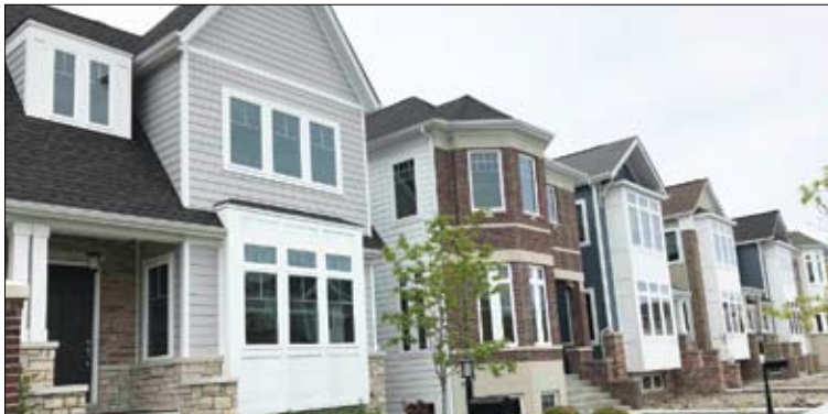
While housing demand is still relatively strong, there is still some fear and restraint from prospective buyers, driven by economic uncertainty.