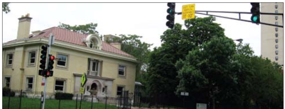
The 59-unit apartment building would be built on the west side of Sheridan Road between Colvin House (one of the area’s last remaining mansions) and a five-story apartment building.