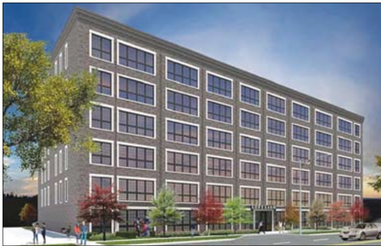
An artist rendering of the proposed gray brick, six-story apartment complex, tabbed Loft Lago, that will occupy the empty lot [photo top] at 5950 N. Sheridan. Construction is expected to start next year and be completed in 2021.