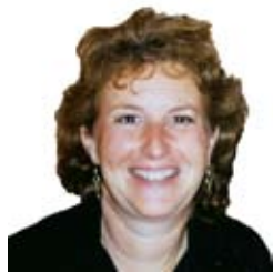
Heart of the 'Hood By Felicia Dechter

The city hopes to save an estimated $1 million in annual savings.