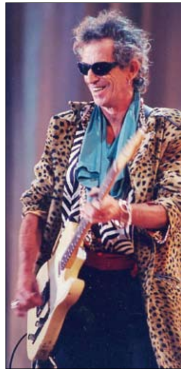
Keith Richards: Soldier Field 1997.