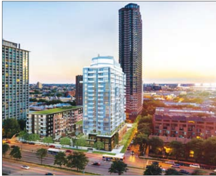
The 46th Ward Zoning and Development Committee met and approved a zoning change for City Club Apartments, 3636 N. Lake Shore Dr., that will be built at the corner of Lake Shore Dr. and Waveland Ave.

restaurant space is planned for the corner of Lake Shore Dr. and Waveland.