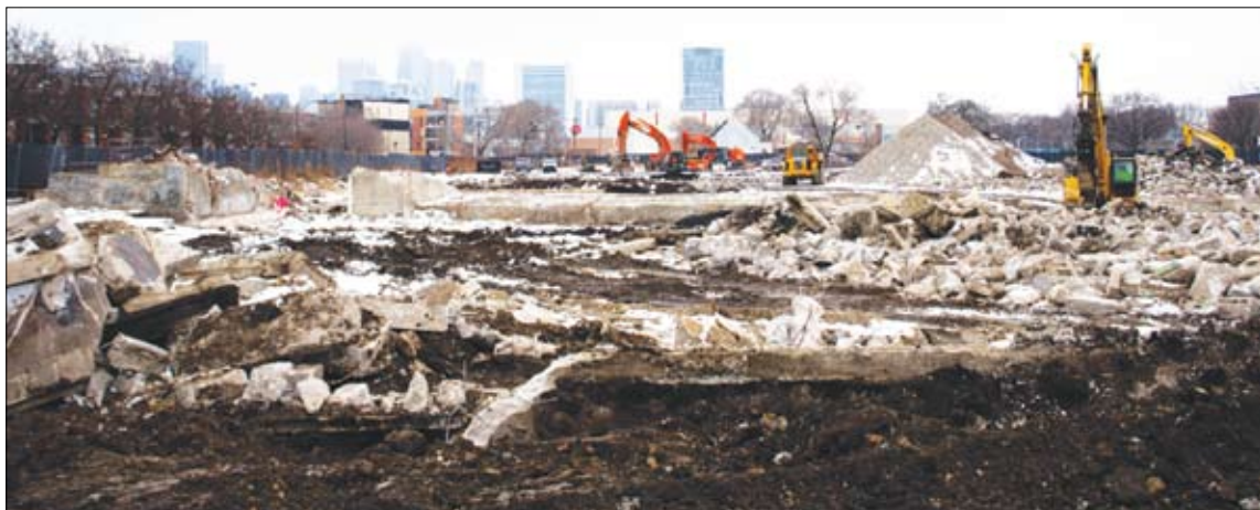
The long-shuttered Near North Career Metropolitan High School was demolished with the help of property tax funds set aside for the redevelopment of the area through a tax increment financing fund. Construction, which is ongoing, is part of the Chicago Housing Authority's plan to redevelop the former site of the Cabrini-Green public housing buildings.

Last year, Lightfoot's administration quietly pushed through the Illinois legislature permission to extend the special designation of a 340-acre area on the Near North Side, including the former