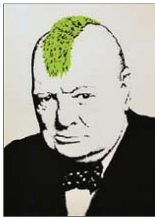
Winston Churchill by Banksy.

MAIFEST: It's been a busy few weeks at DANK Haus in Lincoln Square. Despite a second year with no street affair, they officially kicked off summer with a Maifest earlier this month, where they were fortunate to raise over $40,000 for the Haus. Those German's love a party.