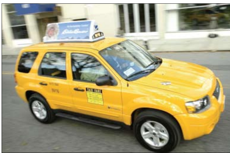
Many Yellow Cab drivers seem to see Uber for what it is, a reheated plate of vegan swill.

I asked her to reconsider, and apologized if anything I said upset her.