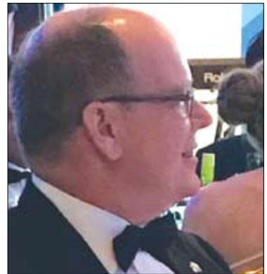
Prince Albert II of Monaco

"While working on these K9s, some of my neighbors would stop by to check them out, seeing their reactions to the K9s when they got up close was really fun to watch."