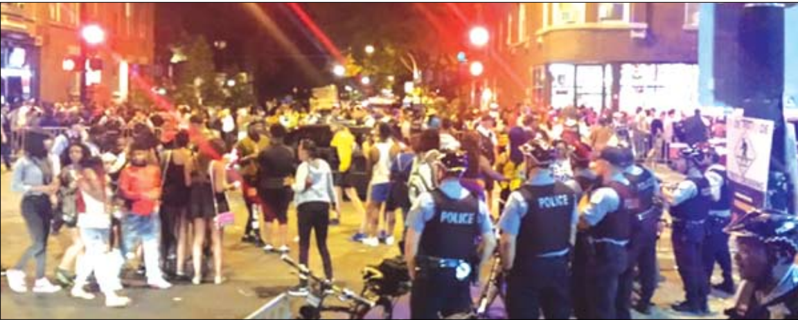
Six hours after Sunday's Pride Parade, police are on standby at Roscoe and Halsted.