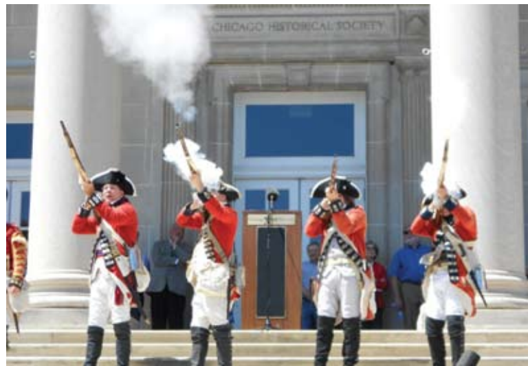
The annual Fourth of July Celebration at the Chicago History Museum is now in its 58th year.

Due to the Independence Day holiday, the Inside Publications deadline for the July 5 newspaper has been moved up to noon Friday, June 30.