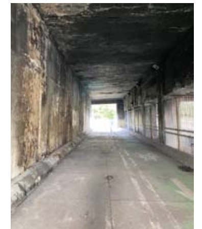
The tent city campers who formerly occupied viaducts under Lake Shore Dr. were relocated to nearby parkland. There are about 18 campers in the Lawrence and Wilson avenue viaducts. Now that they're vacant, the Chicago Dept. of Transportation has agreed to fully repair and repaint the viaducts after they were damaged due to two explosions and a recent fire.

can either return back with all of their belongings, or accept other options that include offers of permanent housing or opportunities that lead to permanent housing. The Dept. of Family and Support Services and other social service agencies continue to actively engage with everyone residing under the viaducts and continue to offer services including housing."