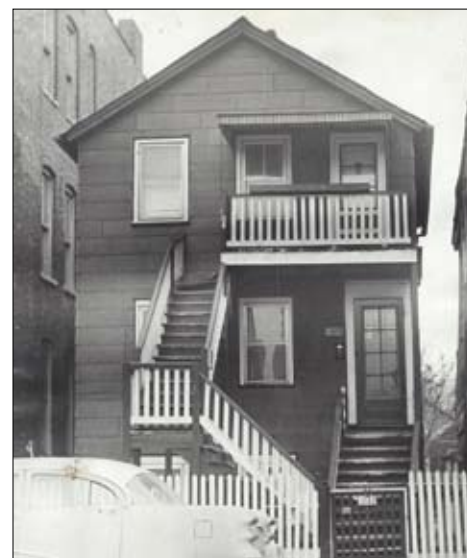
Long before the Royal George Theater was developed, this stretch of Halsted St. was pock-marked with vacant urban renewal lots that sold for as little as $6,000. This writer’s youthful reminiscences of inner-city life collided on Halsted St.—in the late 1940s, 1950s and early 1960s.