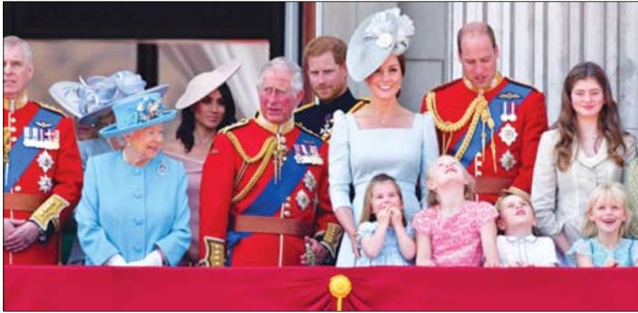
The House of Windsor.

We watched the buildup to and the unfolding of the Platinum Jubilee of the Queen. Beyond all the pageantry, the Archbishop of Canterbury came down with COVID. And was absent. And the national hootenanny sparked with an American super star, Diana Ross.