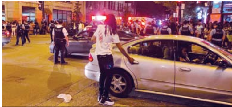
A man wearing a blood-stained shirt enters a car following a triple stabbing on the 1000 block of West Belmont on June 26

an is in critical condition with a gunshot wound to her abdomen. A 30-year-old man who received a gunshot wound to his knee was in good condition. Both were taken to Advocate Illinois Masonic Medical Center. A 37-year-old man was taken to Northwestern Memorial Hospital with a gunshot wound to his leg in good condition.