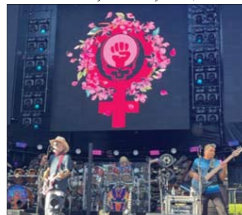
(L-R) Chicagoans came out in full force to voice their outrage at the Supreme Court's overturning of Roe v Wade. Friday and Saturday at Wrigley Field saw the band Dead and Company perform emotional and powerful set lists, including songs of protest, in support of women's rights.