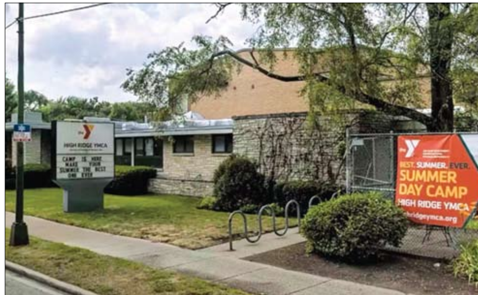
The closing last January of the High Ridge YMCA at Touhy and Western has left a huge gap in the Rogers Park, West Ridge communities. A coalition has been formed to find or build a new kind of community center that will offer programs for kids and seniors alike.

close to beautiful but potentially dangerous Lake Michigan, must have an available indoor pool and swim lessons/water safety instruction," the coalition said on a flier distributed during the recent Artists of the Wall Fest in East Rogers Park. "We lost that when High Ridge closed its doors."