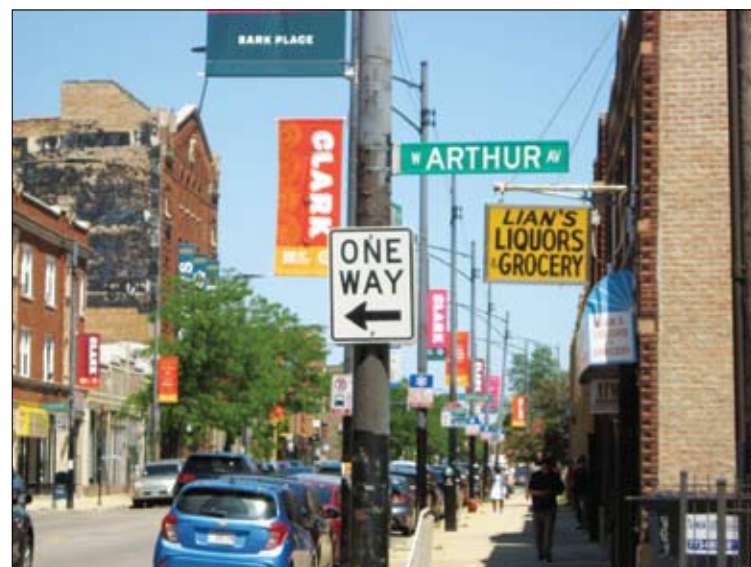
The Clark St. Streetscape Project involves improvements such as a small park at Arthur Avenue between Clark and Ashland.