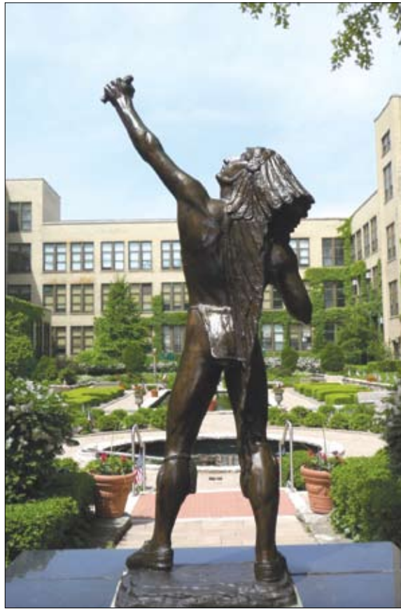
"Shooting the Stars" statue in Lane Tech's Memorial Garden.

From the early days, Lane Tech history is filled with sports stars. Ivy League running back Fritz Pollard (Lane Class of 1912) played at Brown Univ. and for the Akron Pros during the 1920s in the NFL. Pollard, the first African-American football coach in the NFL, and was inducted into the Pro Football Hall of Fame in 2005.