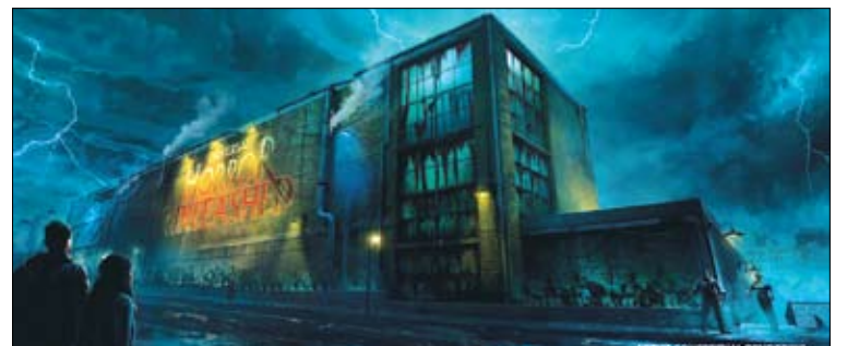
Universal Destinations & Experiences is coming to Chicago.