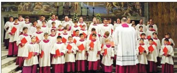
The Sistine Chapel Choir takes the stage in a rare performance Friday, Sept. 5 at the Athenaeum Theater.