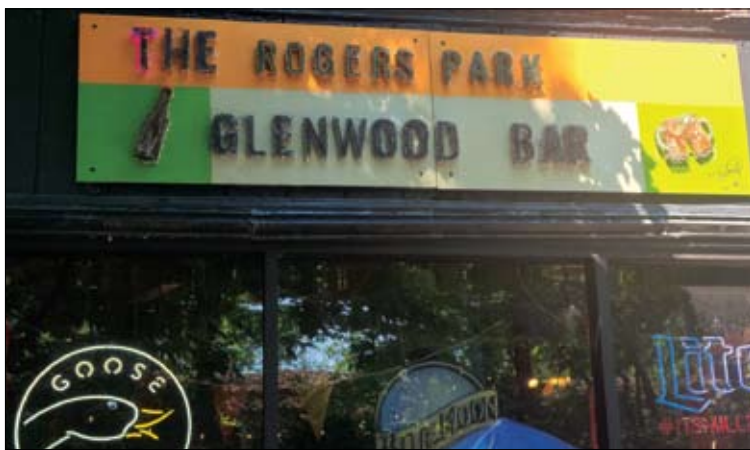
Glenwood Bar, 6962 N. Glenwood is now closed.

Online social media postings about the Pride North cancellation carried comments on the lack of a valid license for The Glenwood