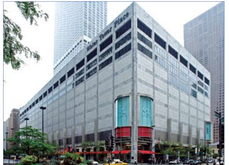
Water Tower Place Mall, 845 N. Michigan Ave.