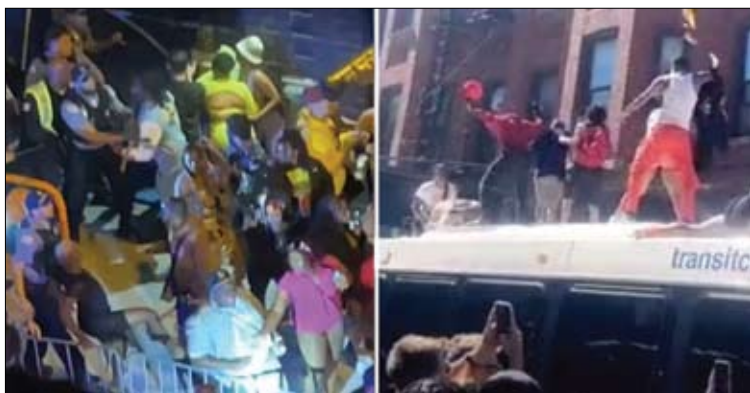
At left, Chicago police officers clash with a post-Chicago Pride Parade crowd near Clark and Belmont on July 1. At right, people dance and twerk atop a CTA bus after the parade.

The second emergency was declared at Clark and Belmont around 1:42 a.m., about 20 minutes after CPD supervisors ordered mass arrests at the intersec-