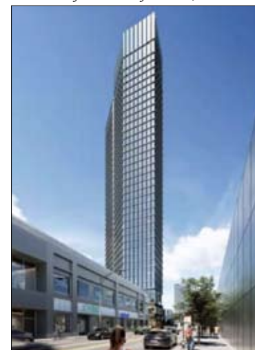
Massive high density, high-rise apartment projects are popping up, or are in the planning stages, nearly everywhere, leaving many to wonder what will happen to all the B and C class commercial buildings now suffering from historic vacancy rates. So nobody wants to go to their high-rise offices, but they do want to live in a high-rise?