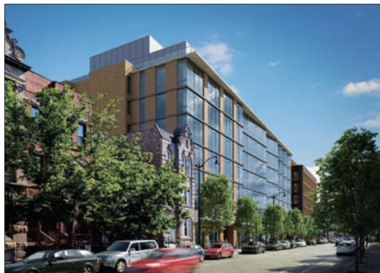
One of the few mid-rises proposed is going up at North Ave. and Halsted St. Developer Draper and Kramer has received Plan Commission approval for 1649 N. Halsted, a 9-story residential building.

"Due to its underlying zoning, strong retail core, and proximity