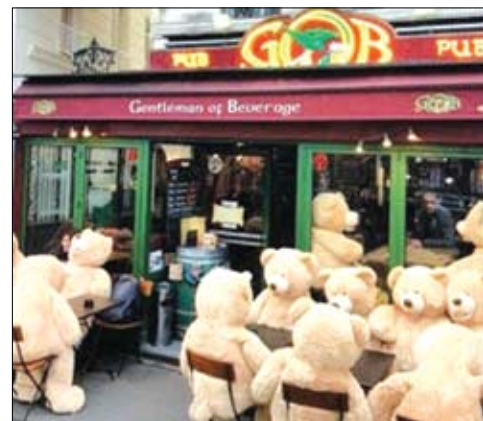
Bears in Paris.