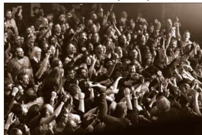
Are mosh pit, stage-crushing crowds like this 2017 concert at the Riviera Theater a thing of the past?