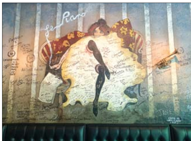
Performing artists sign the wall at Le Piano, 6970 N. Glenwood Ave.