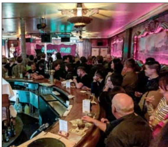
The Green Mill during pre-pandemic days.