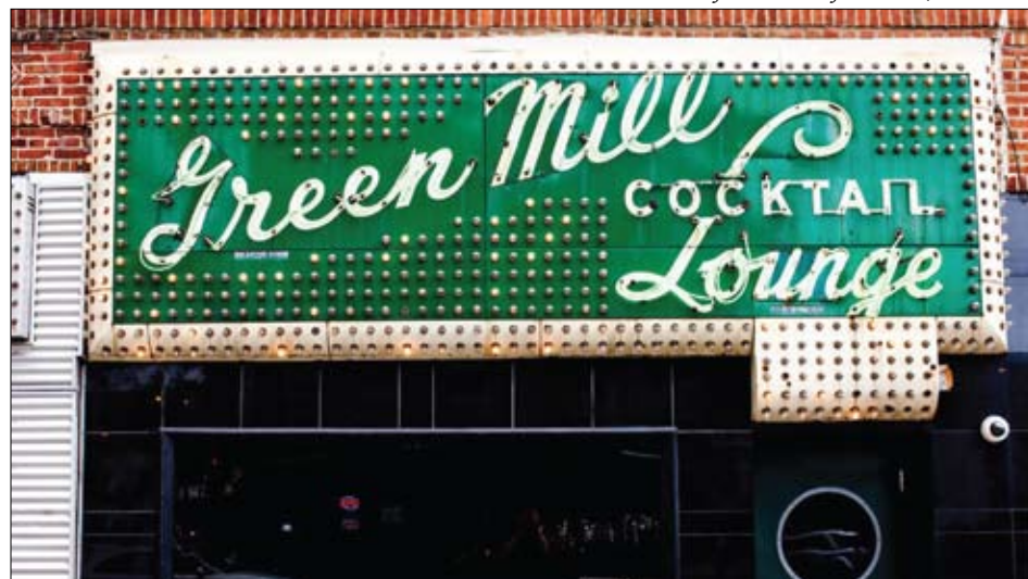
The Green Mill, 4802 N. Broadway.

The Angels with Tails event in Roscoe Village is a homeless pet adoption event that rallies the whole community around homeless animals.