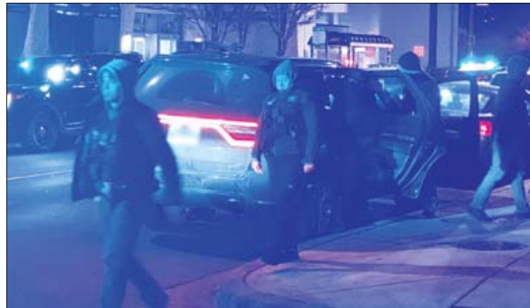
Chicago police officers conduct a traffic stop in Lakeview in Feb, 2020.

Alexander's Restaurant has been a mainstay of the Edgewater community since the early 1960s. According to a recently created GoFundMe, the family that owns Alexander's is hoping to raise $20,000 to help with repairs.