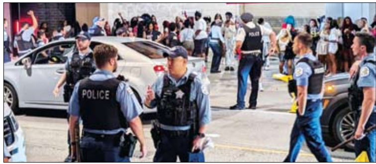
Chicago police officers break up a crowd gathered in the 3100 block of N. Clark after the 2024 Chicago Pride Parade.