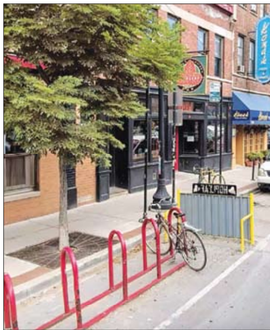
Hopleaf worked for years to be allowed to put two bike racks in the parking lane in front of 5148 N. Clark St., for their employees and customers who come on their bikes, installing them yearly in April and taking them down in November.