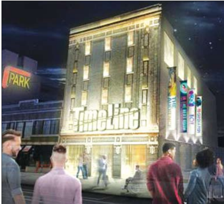
TimeLine Theater plans to build two intimate and flexible black box theaters of 250 and 150 seats at 5033-5035 N. Broadway.

According to their plan, their first initiative is their Community Connection Project [CCP]. The plan to partner with their