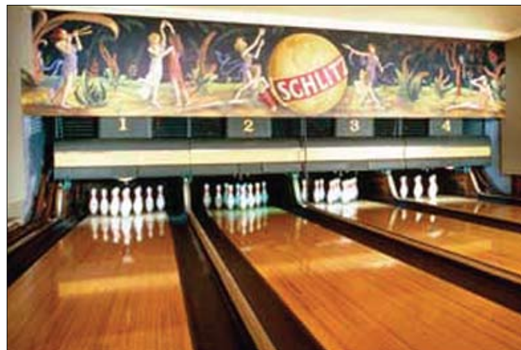
When Southport Lanes gained its independence from being a tied house in 1922, it was re-christened Southport Lanes in honor of the four bowling lanes that were soon installed.