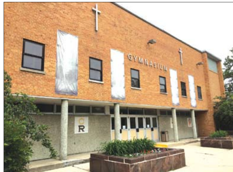
Lexington Homes hopes to build 88 townhomes and a six-story apartment building with 269 apartments at the former site of Gordon Tech College Prep High School.