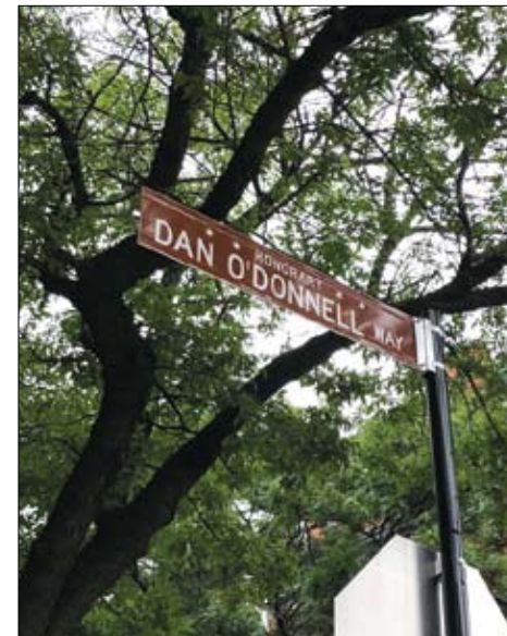
The O'Donnell Family helped make the intersection what it is today, and now there's proof.