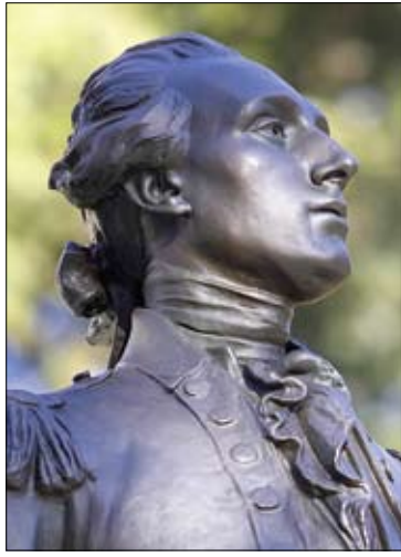
A Marquis de Lafayette statue on the campus of Lafayette College in Easton, PA, the only college in America to bear his name in.

French Rulers from Pepin, Charlamagne, Charles the Bald, all the Kings Louis, Robespierre, Napoleon, de Gaulle, Pompidou, Chirac to Macron, have worked with passion to make the French arc of governance widely felt. Like the goings-on of family, if