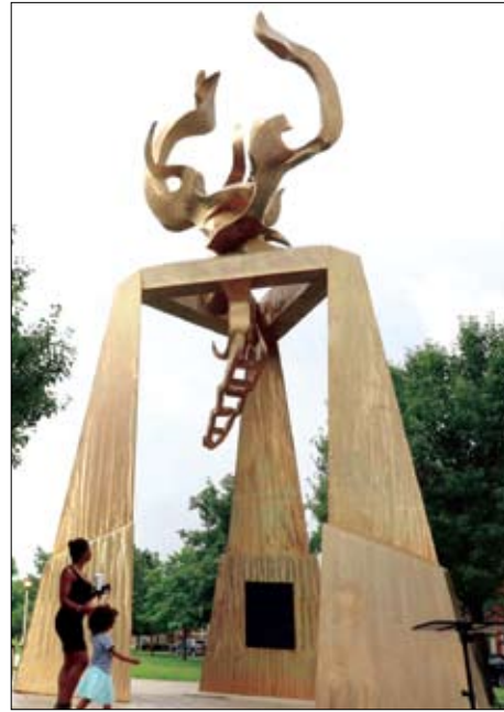
Ida B. Wells monument (L) and sculptor Richard Hunt.

He is one of only six foreign nationals to be given U.S. citizenship by Congress. Every year on July 4th the American ambassador to France visits the grave with U.S. Marines. The U.S. flag is raised at the grave and the American National Anthem is played. These events at Picpus have been observed since the First World War. The flag was permitted to fly unencumbered even during the German occupation of World War II. There are no dry eyes in Picpus when America's anthem is sung. So strong are the ties that still attach us to the young bub-