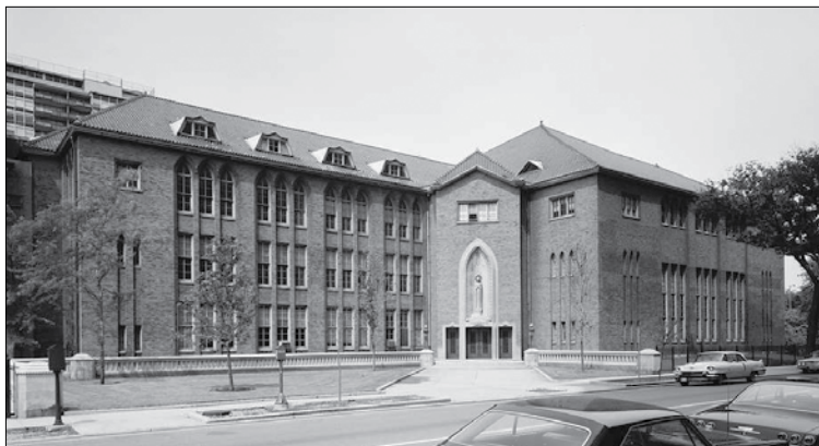
The Immaculata complex is a designated Chicago Landmark.

"We are concerned about the impact of a proposed 23-story, 495 unit building on The Immaculata complex - a Designed Chicago Landmark, along with the repercussions of the proposed tower on such buildings as the neighboring "Paddington Apartments," the Buena Park Community, and the larger community. We are hopeful that any proposed development on this site will be ultra-sensitive to this historic complex. This community certainly has experienced much growth in the past and the blocks of W. Irving Park Rd., near Marine Dr., have been overwhelmed with large and tall high-rise buildings, since the early 1960s, to a point of over-