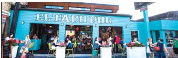
Feast on Lincoln will feature over 10 restaurants between Wrightwood and Fullerton avenues with extended seating onto Lincoln Ave.