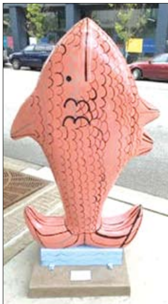
Molly McGrath's "Smokey the Salmon."