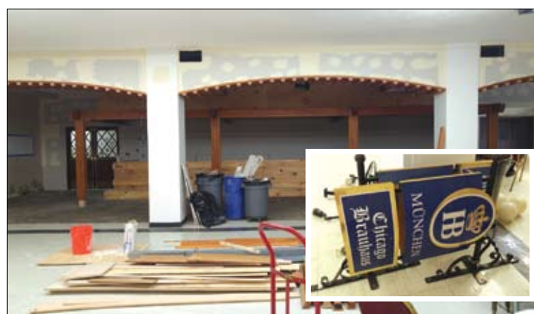
DANKHaus guests will soon be able to enjoy a stein of beer and a German pretzel in a space resembling the old Chicago Brauhaus bar.