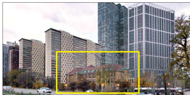
The proposal by Chicago-based CA Ventures includes a total of 495 units. If approved, the project would have converted the landmarked Immaculata High School, 640 W. Irving Park Rd., [low slung building in center] into 275 residential units and a high-rise tower that includes 220 units for senior citizens.