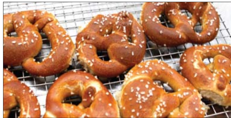
The secret to great German pretzels is the addition of buttermilk and buckwheat flour to the ingredients, as well as the traditional bathing of the dough in lye before baking.

For more information about Buena Park Neighbors write to Buena Park Neighbors, send an email to general@buenaparkneighbors.org . You can also visit their web-site at https://buenaparkneighbors.org/ .