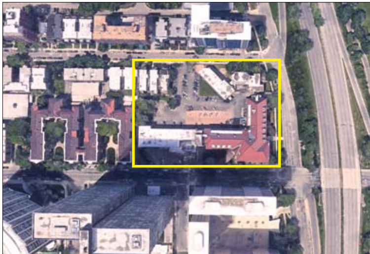
Some people believe the character of the surrounding neighborhood near Irving Park and Sheridan roads would change dramatically if the developer's plans had been approved and built.