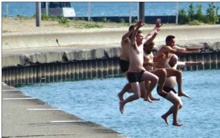
City Hall has issued a swim ban for all North Side-area beaches, but again this last weekend there were plenty of people willing to risk it to enjoy a dip in Lake Michigan.