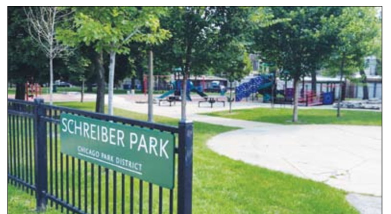
The largest portion of the Clark St. streetscape project includes closing Arthur Ave. between Clark St. and Ashland Ave. to create a pedestrian zone and walking path that will expand the green space of the nearby Schreiber Park, 1552 W. Schreiber Ave.

"The plaza will be more like a park with benches and landscaping and Arthur Ave. will be closed, to become a pedestrian plaza," she said. "The new pub-