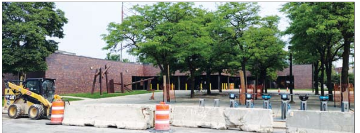
One of the first steps in the Clark St. streetscape project is renovating the courtyard at the Chicago Police Department's 24th District, 6464 N. Clark St.