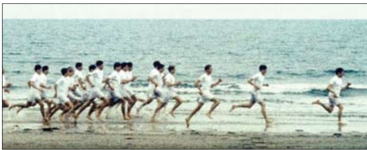
This columnist has watched the movie "Chariots of Fire," 22 times.

Then there's the remembrance of fresh friends from new and ancient worlds. Refined, inquisitive, thoughtful and generous. The perfect blend of folk whose lives really did rearrange so much meaning in my life.