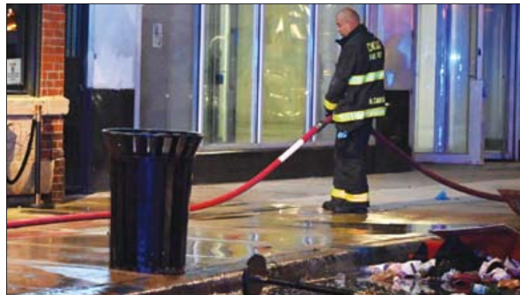
A Chicago firefighter washes blood from the sidewalk following a mass shooting outside Artis Lounge, 311 W. Chicago Ave., on July 2.