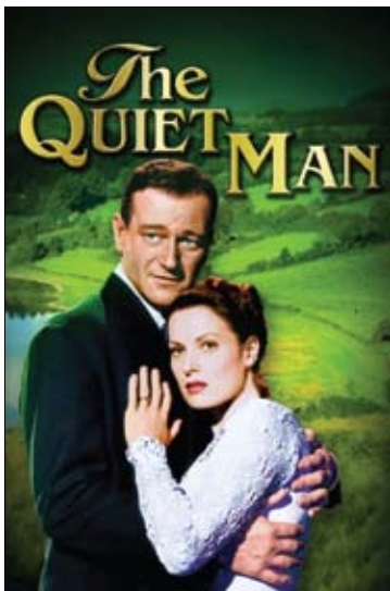
The Quiet Man is based on a 1933 Saturday Evening Post short story by Irish novelist Maurice Walsh. The story was adapted for the movie by screenwriters Frank S Nugent and Richard Llewellyn.

Next up, I rewatched that classic 1952 John Ford tale of Irish identity and self-discovery, "The Quiet Man." A tale set in the old Ireland, before the European Union and ready cash. The Ireland of my grandparents time. An Ireland I discovered as a boy when I traveled across the Atlantic with family on a Cunard liner, Georgian refinements and daily equestrian adventures.