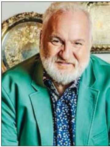
Chef Art Smith