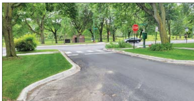
This photo of the 6800 block of N. Bell Ave. shows a new CDOT design that impedes ADA access. The bump outs intentionally narrow the roadway, leaving paratransit drivers facing head on traffic troubles when their vehicles block roadways as they stop to pick up disabled riders. The narrowest, most constricted part of the newly redesigned intersection is where ADA sidewalk ramps meet the roadway, removing any buffer between the disabled and their mode of transportation, and oncoming traffic.

The Pratt project includes both concrete work and asphalt re-