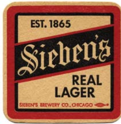
(L_R) The famed Barrel House on North and Halsted. Sieben's beer logo.