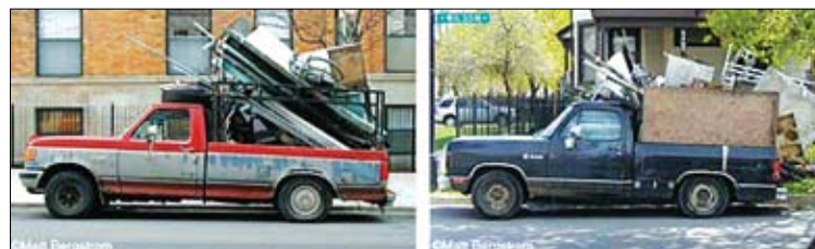
Anything made of metal left in the alley may turn up on the back of a scrapper truck.