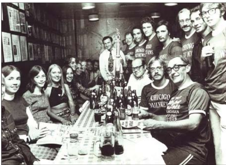
Daily News softball team, 1974 CDN Media League champs, at Billy Goat Tavern with wives and pals swilling gallons of beer.

Sieben’s Brewery, at 1454-1478 N. Larabee St., was one of the biggest and best. It had its own “bier stube” or beer hall, and a spacious outdoor garden that could seat up to 100 avid beer