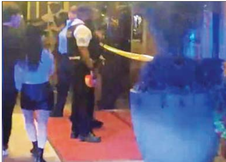
Chicago police stand near crime scene tape at the entrance to the Virgin Hotel, 203 N. Wabash, after a man who was shot nearby collapsed in the lobby on July 21.

Before July 21, the most recent shooting in the Loop occurred near the State-Van Buren L sta-