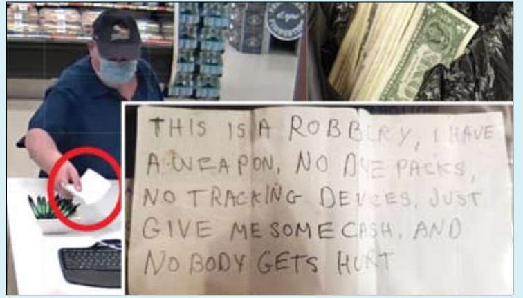
The bank robber hands over a note before fleeing with a bag of cash at Huntington Bank, 4355 N. Sheridan.

the cops pulled over a CTA bus that seemed to be moving in sync with the bank's GPS device.