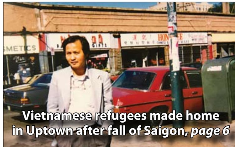
Vietnamese refugees made home in Uptown after fall of Saigon, page 6