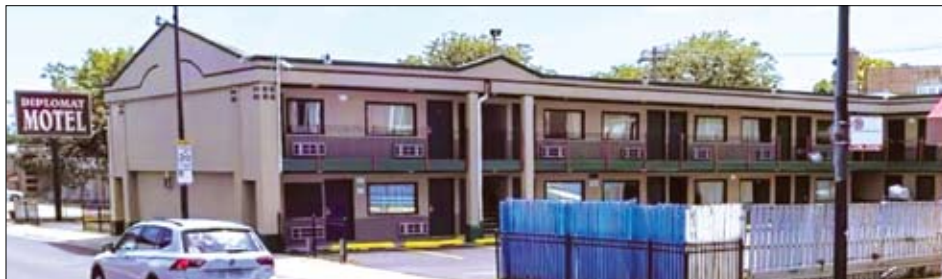
City Hall has set aside $30 million for the Diplomat Motel acquisition and five other properties eyed for refugee shelter operations. The 20,000-square-foot Diplomat Motel space would hold up to 40 private units available for stays reportedly of only three to six months.

Some of the costs associated with the experiment in homeless housing are now coming forward as Chicago officials close in on plans to transform the Diplomat Motel, 5230 N. Lincoln Ave., into a housing pilot that would provide on-site substance abuse and mental health treatment. It may cost taxpayers as much as $30 million over the next five years.