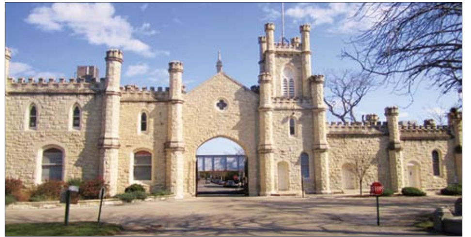
Those who would like to join a guided tour of Rosehill Cemetery should meet at the main gate, 2:30 p.m. Aug. 12, advanced registration is not required.

Rosehill Cemetery received the City Cemetery's first disinterred remains in 1859, when it became Chicago's first pri-