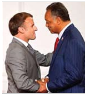
President Emmanuel Macron and Rev. Jesse Jackson.