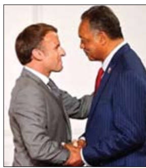
President Emmanuel Macron and Rev. Jesse Jackson.