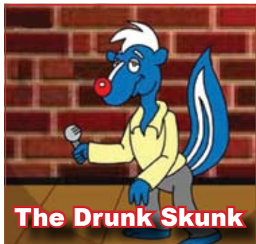
The Drunk Skunk Funny cartoon video about an intoxicated skunk trying his hand at stand-up comedy. View at: https://www.colemantoons.com/skunk.html