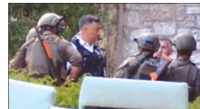
Chicago police SWAT personnel huddle with 19th District police leaders near an apartment building on the 500 block of W. Aldine on July 26.

The future is ever-changing, and COVID has definitely changed the landscape of our world.