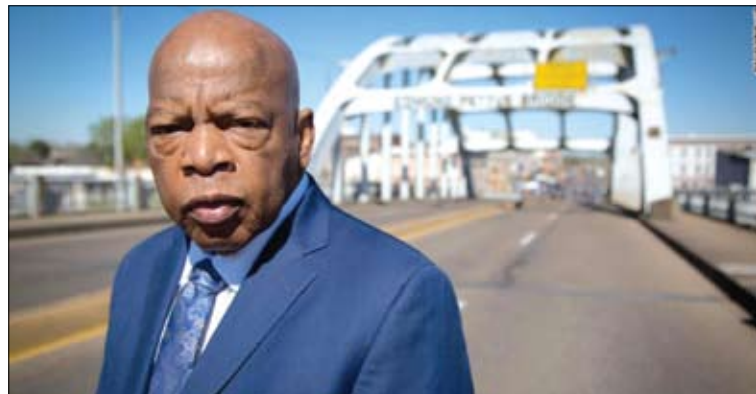
Congressman John Lewis.

My Wicker Park neighborhood is home to many of the leadership among the agitators and demonstrators. You don't have to look far to see the tell-tale signs of the cancel-culture. Lampposts and street signs serve as natural sign boards for information and details of where the mobs are going next. The six corners of Milwaukee, North and Damen appear