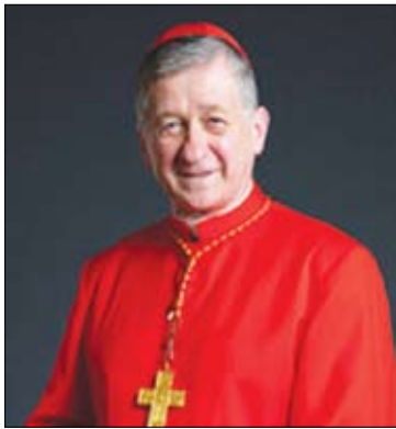
Cardinal Blase Cupich