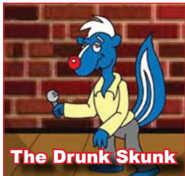
The Drunk Skunk

Funny cartoon video about an intoxicated skunk trying his hand at stand-up comedy. View at: https://www.colemantoons.com/skunk.html