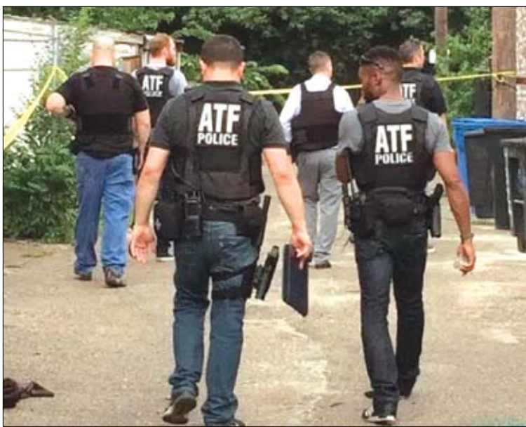
Chicago police and ATF agents work a crime scene in 2017.