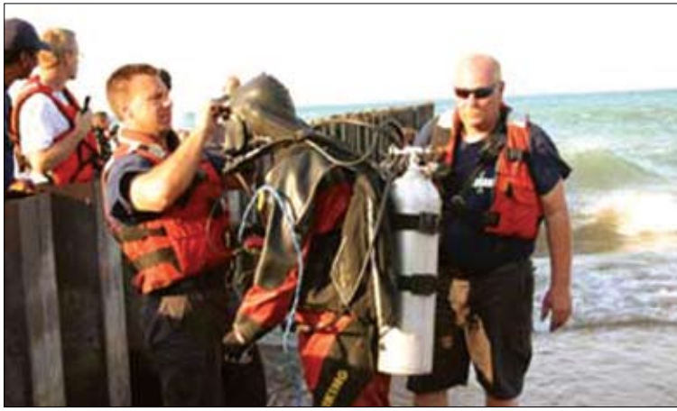
Divers searching Lake Michigan at Lunt Avenue a few years ago after a teen disappeared into the water and drowned.

And now, all these years later, after living on the beach for the last four decades, it has almost become a yearly ritual to see a massive search taking place for