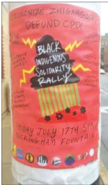
Poster in Wicker Park.

They also came armed with the knowledge that the mayor will not