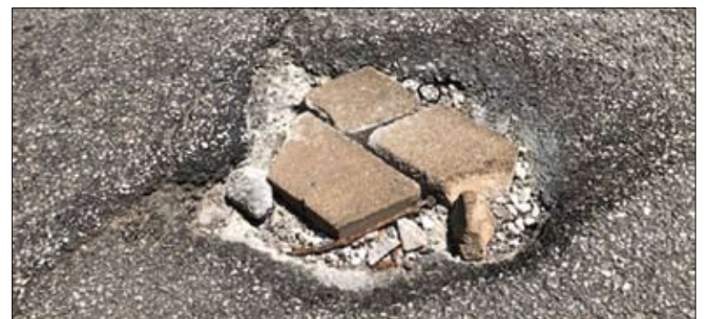
Citizens have taken to repairing potholes on their own, like this one in the southbound lane at 5250 N. Ashland. A man who lives near this pothole claimed to have 'patched' the pothole himself with bricks after repair requests to his Alderman were ignored.

Asphalt resurfacing is usually done in several blocks at a time. The existing asphalt is first milled; 2-3 weeks later, the first layer of asphalt is laid, and 2-3 weeks after that, the second and final layer of asphalt is laid. Arterial resurfacing projects do not