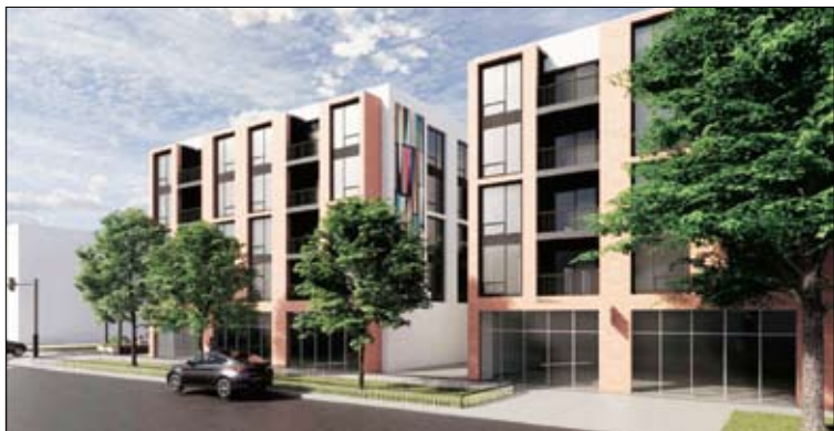
The plan for this development was reduced to four stories from six, and now includes commercial space.

Demolition of the former Campion Hall is now underway, and the new center is expected to open in time for the fall 2028 semester.