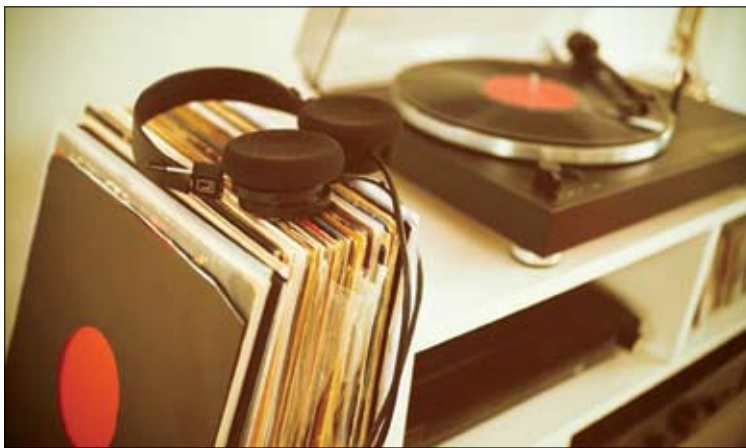
Music has the power to kindle emotions, moods, and states of mind.

my Heart," came into the world almost four decades later, and demonstrates a world of more maturing emotion and bold engagement. But with the music a truer picture of love, harmonics and philosophy from Collins, the English drummer. A bigger picture of hope. "You'll be here in my heart always." I think the song is really meant for his brand new baby daughter, then, Lily Collins.