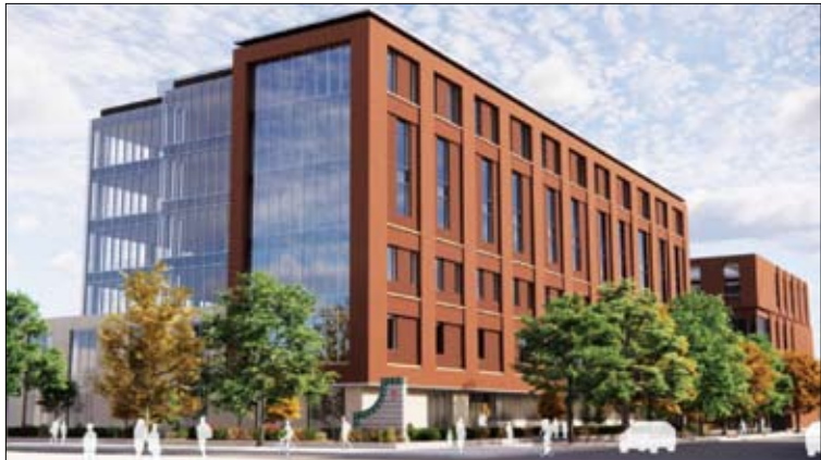
Rendering of new sciences building at Loyola Univ. Courtesy Woodhouse Tinucci Architects