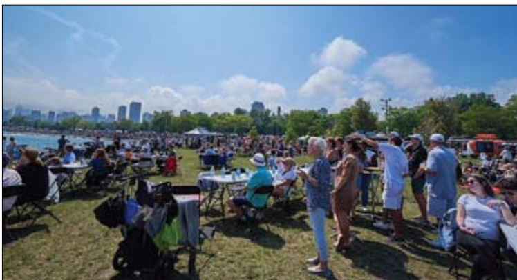
Located on the eastern point of Fullerton, Lakefront Green at Theater on the Lake may be the ideal place to catch the Air and Water Show.

The Lakefront Green, 2401 N. Lake Shore Dr., hosts a vibrant and scenic viewing party in its 3-acre outdoor space just south of Theater on the Lake. Perched on the point facing south toward North Ave. Beach, guests enjoy barbecue from Smoque BBQ, an open bar with beer, wine and