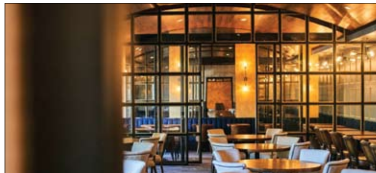
Onward, 6580 N. Sheridan Rd.