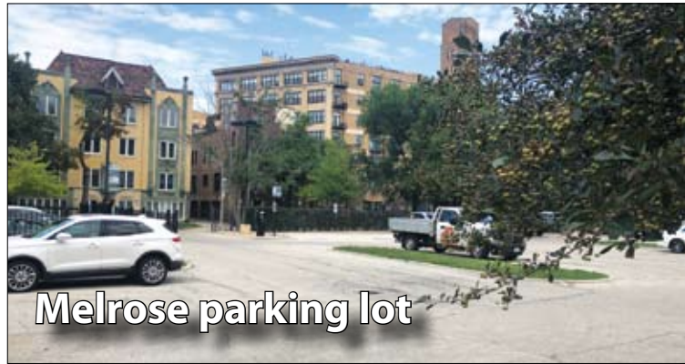
Melrose parking lot

After an apartment building for senior citizens was built at the corner of Bel-