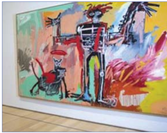
Ken Griffin's $100 million Basquiat painting.