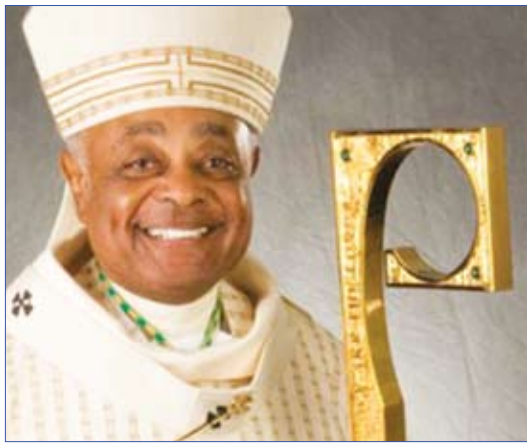
Archbishop Wilton Gregory

As for the four-wheeled taxis, in Aug. of 2019 there were 3,433 active medallions, or about half of the city's total of 7,000 taxi medallions. Presently that number has fallen below 600. And perhaps most shockingly, over 2,200 taxi medallions have actually surrendered back to the city as worthless. In 2015 a Chicago Taxi Medallion would fetch $290,000.