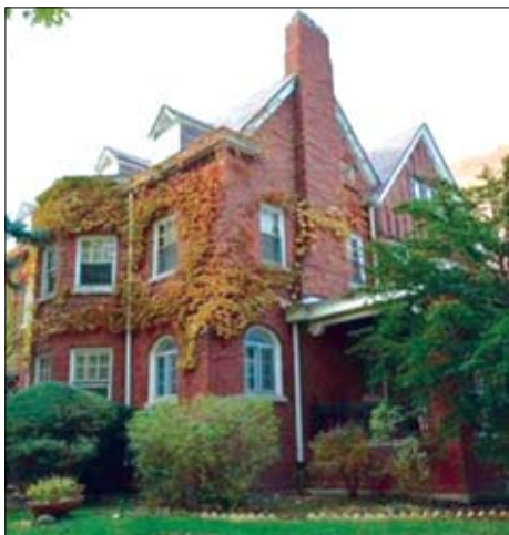
The former residence of Ken Nordine at 6106 N. Kenmore Ave.