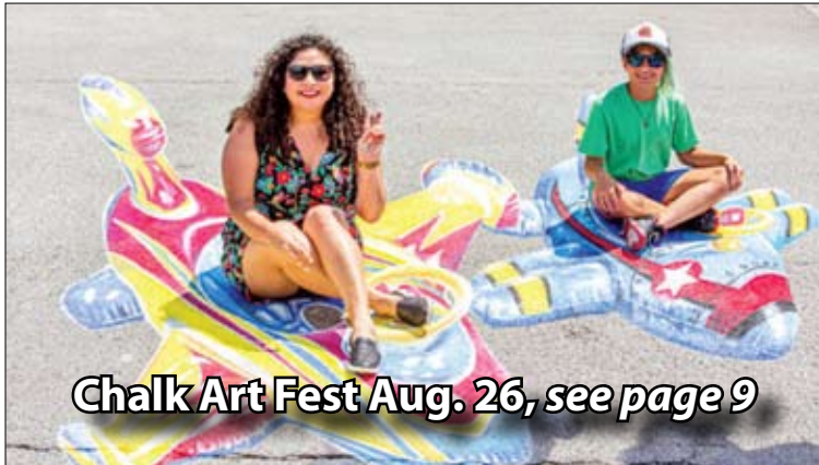
Chalk Art Fest Aug. 26, see page 9