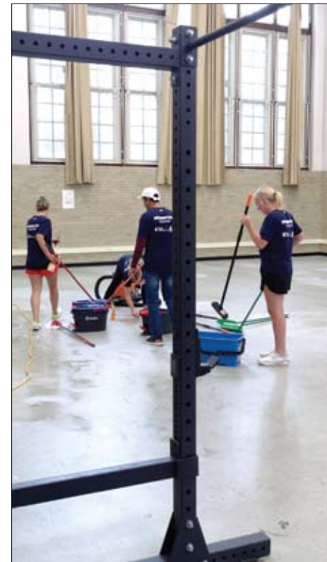
(L) Volunteers from UnitedHealthcare assemble chairs and other furniture for the coaches' room as part of the renovation of the school's fitness spaces. (R) More than 70 UnitedHealthcare volunteers assisted in updating the school's gym and fitness areas during the two-day volunteer project at Senn High School.