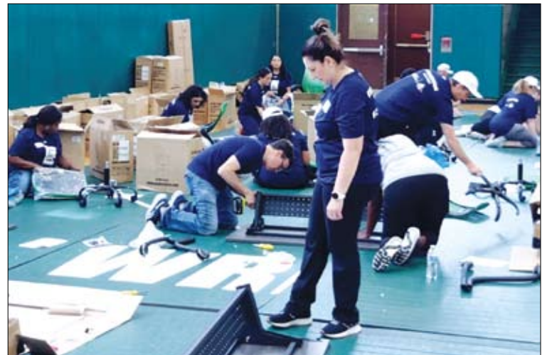
Volunteers prepare a floor area for a new surface in the weight room at Senn High School, 5900 N. Glenwood in Edgewater, as part of the Cal Ripken, Sr. Foundation’s 2023 Team8Tour.

The initiative is part of UnitedHealthcare’s (UHC) “Do Good.