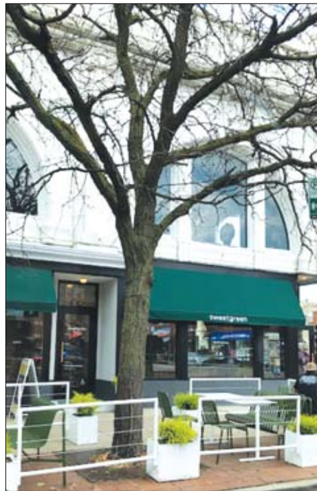
Dead tree at Balmoral Ave. and Clark St.

So neighbors, the next time you sit down at a sidewalk cafe, look around. Is there a tree in the space? (Look up if it's dead.) Is the rain grate free and clear? Or are you