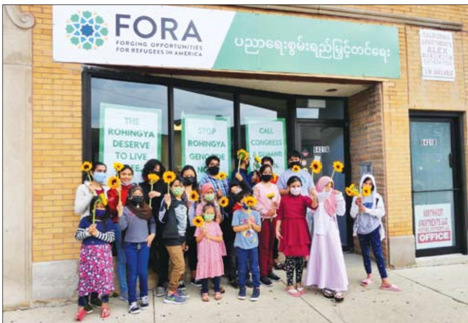
Forging Opportunities for Refugees in America opened in 2019 with just 12 refugee students, and demand quickly expanded.

To register for tickets to attend visit www.shakeshackpickleballclubchi.splashthat.com/ .