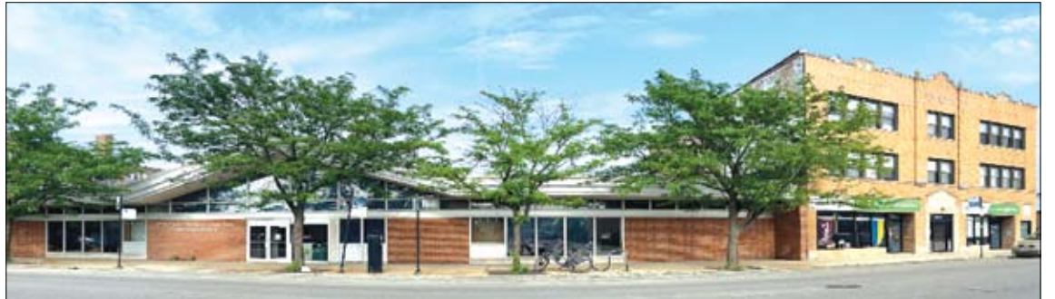
The former Northtown Branch of the Chicago Public library in West Ridge has been purchased from the city by a non-profit who will use it as a refugee learning center.

The building that once housed the former Northtown Branch of the Chicago Public library has been purchased by a non-profit, and will soon become a refugee learning center.