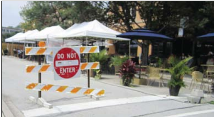
Looking west at a closed section of Jarvis (at Greenview) as part of a city program creating outdoor spaces in 15 neighborhoods. The Alfresco Challenge is part of a broader city initiative to open streets and create places for dining and other public activities.