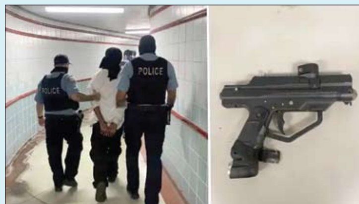
Chicago police officers escorting the suspect from the Roosevelt station (L) and the "air soft" pistol CPD allegedly found in the man's backpack.

Chicago police on Aug. 6 arrested a suspect in a series of pistol-whippings and "person with a gun" sightings along the CTA's train system this week. Officers allegedly found an air pistol in his backpack.