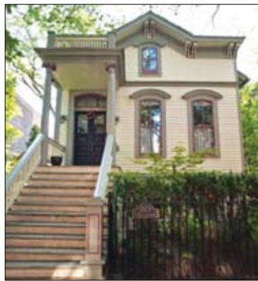
Barringer cottage.