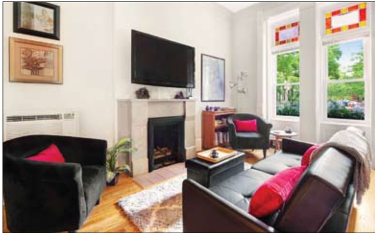
An industry survey of Chicago vacation-home and shared properties shows that summer bookings are currently running 40% or more over 2019 levels.

In the summer of 2020, the Chicago City Council approved regulatory measures to combat