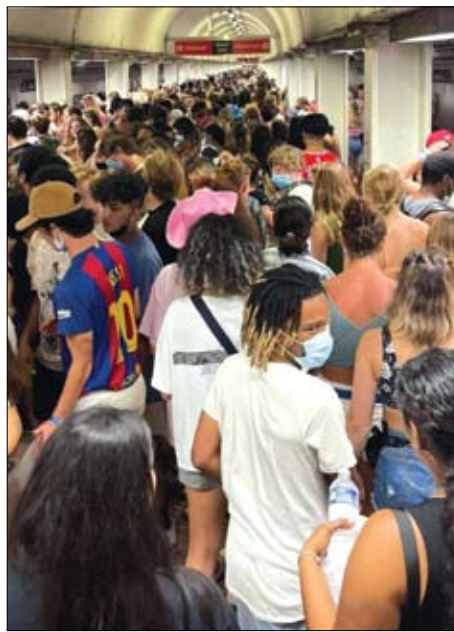
A jam-packed CTA station after Lollapalooza.

"She was totally in the dark, which was also disturbing to me," he said. "By design or by defeat it flew under the radar, when the variant is up-ticking." It was reckless