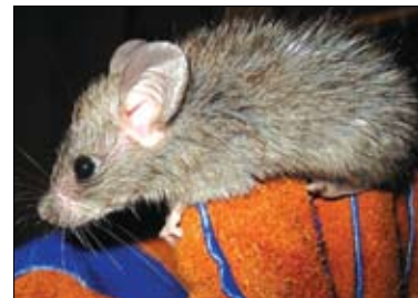
Most wild animals don't really want to risk running into you by accident, so they're most likely to inhabit the parts of your home that are least inhabited.

And which animals are those, exactly, in the Chicago area?