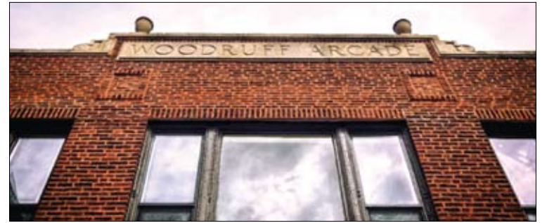
Front entrance of the former Woodruff Arcade.

The CTA has invited the public to hear about their plans for the Lawrence, Argyle, Berwyn and Bryn Mawr Red Line stations during community meetings.