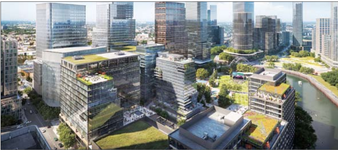
Sterling Bay's Lincoln Yards project seemed like a sure winner, with the large swath of riverfront property on the North Branch of the Chicago River and a sweet TIF deal that meant they kept all the property taxes. Then a commercial glut and high interest rates changed everything.