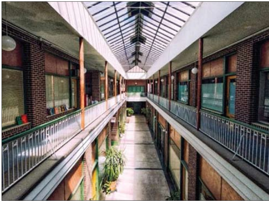
What made this Woodruff Arcade building unique [above] was its interior. Inside was a two-story courtyard with a grand glass skylight.