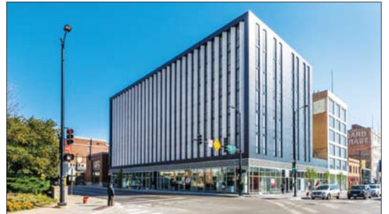
1135 W. Sheridan Rd.