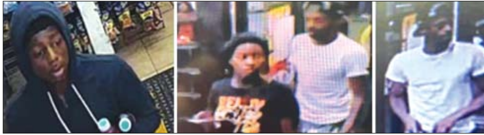
Postal inspectors are trying to identify these suspects as they investigate the shooting and robbery of a mail carrier in Chicago.

Mail theft by crews using stolen postal service master keys has become so widespread that the U.S. Postal Service has ad-