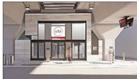
The CTA will create original designs for the new Lawrence, Argyle, Berwyn and Bryn Mawr stations that identify with their neighborhoods.