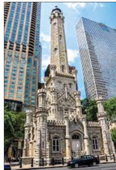
Chicago Water Tower