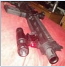
Rifle-like paintball gun.

As this newspaper reported at the time of the pair's arrest, McCaskill's Facebook page included a video showing an apparent stranger running in fear after being threatened with what is later shown to be a fake rifle.