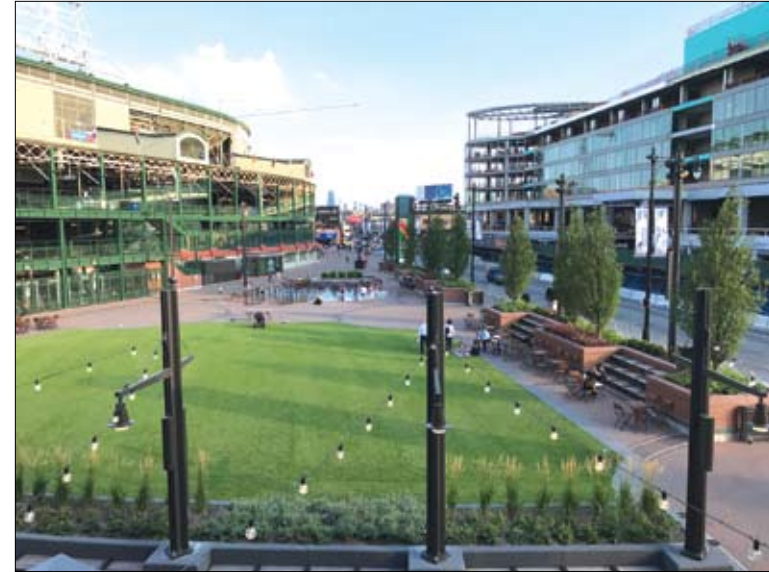
A view of The Park from Brickhouse Tavern.