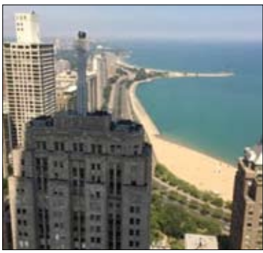
Lake Shore Drive and the sandy shores of the lakefront.