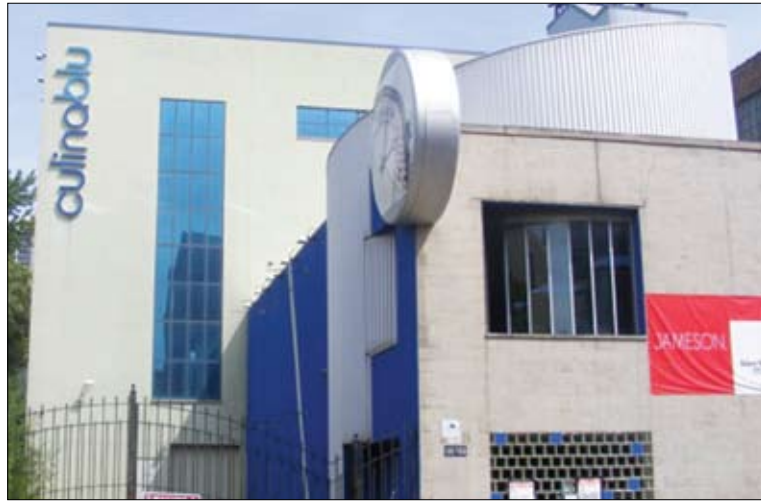
The former Culinablu at 1521 N. Sedgwick will never be converted into a homeless shelter if the newly-organized Old Town Neighbors Vote gets its way.

LPCS is a social service agency serving homeless adult men and women through an alliance of four Lincoln Park churches: Lincoln Park Presbyterian, St. Clement, St. Pauls and Church of Our Savior. They now work out of the Presbyterian church basement on Fullerton Pkwy. LPCS has been providing shelter and other basic needs to the community since 1985. They provides interim hous-