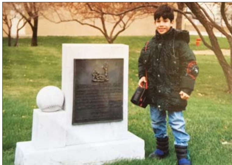
Seen here with an unknown child is the famed stone and brass “Chicago’s Game” monument commemorating the birth of the game of 16” softball in Chicago.

Later it was moved to its current landscaped spot behind a wrought-iron fence on the lakefront jogging path forgotten until former Ald.