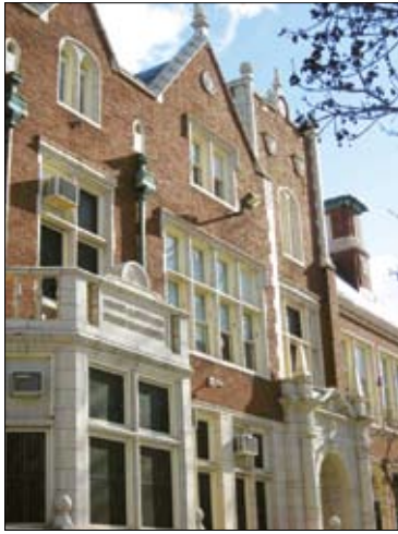
Sullivan High School, 6631 N. Bosworth, was the site for the Aug. 17 Community Conversation Town Hall meeting. The final meeting will be Aug. 24 at George Westinghouse College Prep.