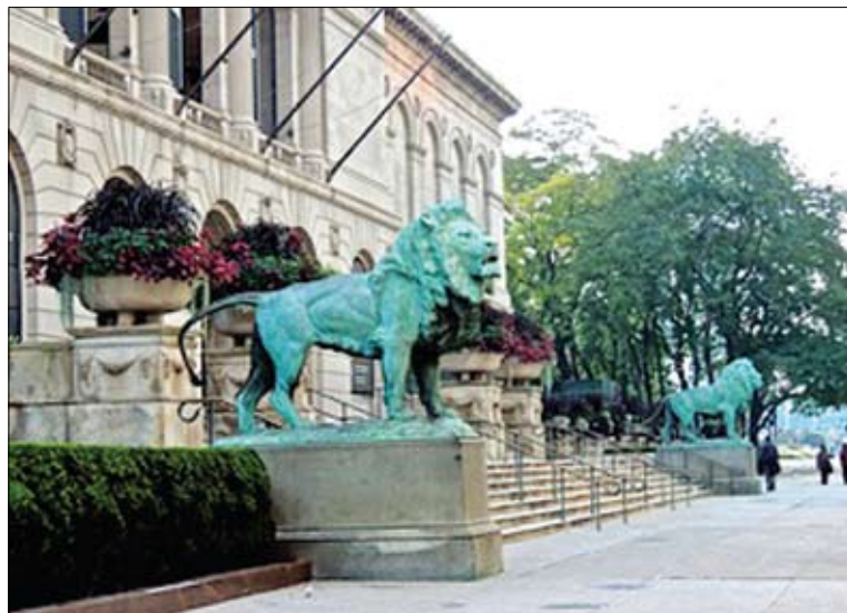
Art Institute Lions... "On the Prowl" (north) and "In Defiance" (south).

Chicago's image of itself has always been adventurous, not hard to understand when you think we descend from fur-trapping huts and a military fort. Chicago al-