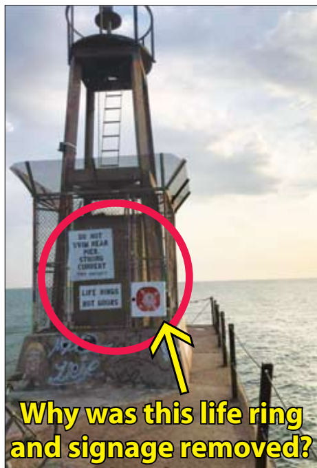
New signage and a life safety ring were installed, and removed, at Pratt Pier last week after the drowning of a 19-year-old man on Aug. 22. It was the second drowning on the pier in the last two years.