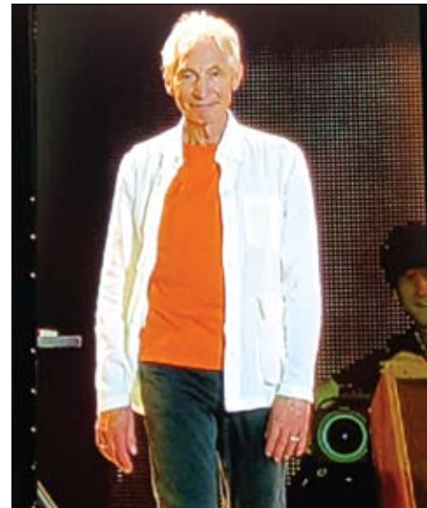
This columnist snapped one of her all-time favorite shots of Charlie Watts as he stepped out from behind the drums to greet the crowd at Soldier Field during the kick-off of the Rolling Stones' No Filter Tour, June 2019.

In 2002, I had another encounter with Charlie, this time at the Ritz Carlton in Water Tower. Charlie once again was charming and gave my daughter and I his