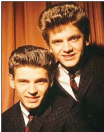
The Everly Brothers

That's what I was ruminating about as I read a British tabloid. The Daily Mail had fresh ammunition for the warfare in the House of Windsor. Their report-