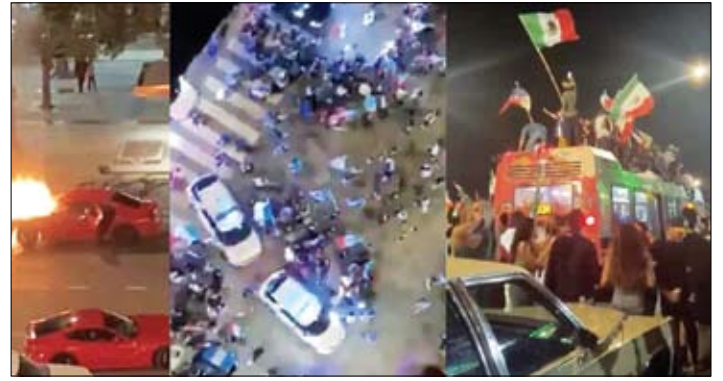
September 16 is Mexican Independence Day and revelers are expected to block roadways and cause traffic jams.