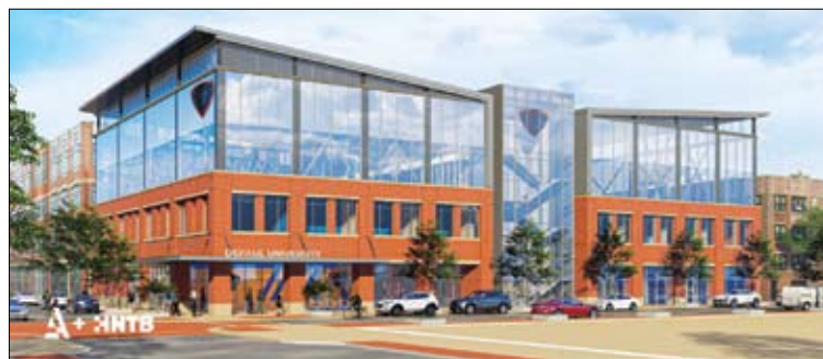
A rendering of the proposed basketball practice facility to be housed on the Lincoln Park Campus, projected to begin construction in summer 2025 and be completed by fall 2026.

The new facility will feature an exterior, brick façade that mirrors the aesthetic of the Lincoln Park neighborhood, and a pitched roof that pays homage to DePaul's former Lincoln Park arena, Alumni Hall, where the Blue Demon men's basketball team won nearly