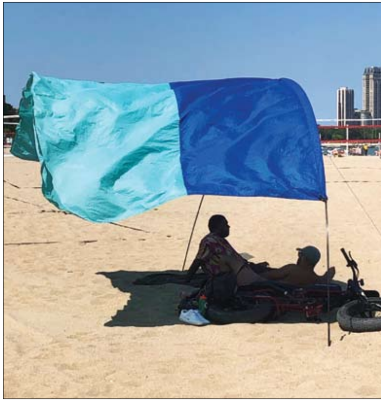
As the summer beach season wanes, only a sparse crowd of diehard volleyball players inhabit a wide stretch of lonely North Avenue Beach. One last blast of warm east wind transforms a beach tent into a colorful tunnel that seems to be caught in mid-motion while two players relax in its embracing shadows. In other words, its going to be ice cold soon so get the heck out there.