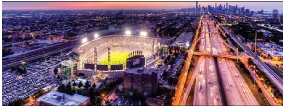
Is Guaranteed Rate Field as expendable as the team?

In any futuristic protest march I'm sure the ghosts of former manager Al Lopez would be front and center, together with Nellie Fox, Luis Aparicio, Billy Pierce, Sherm Lollar and Minnie Miñoso, all golden heroes of the 1959 Sox. They would not only be present,