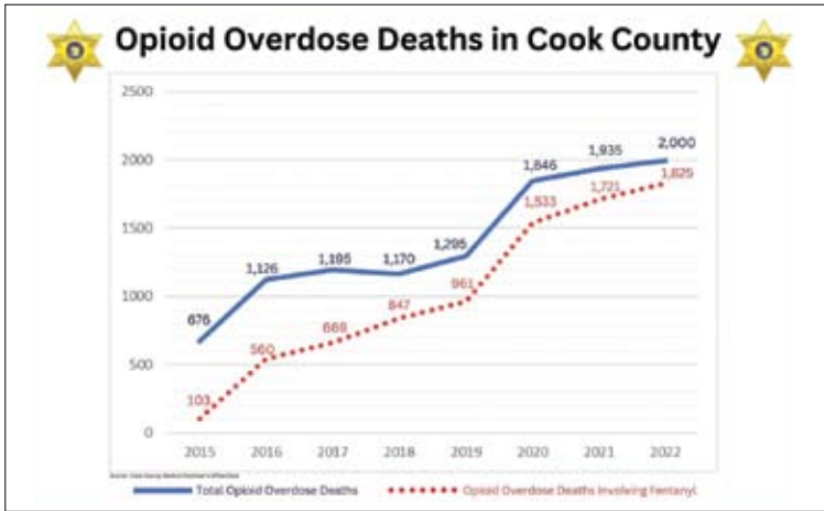
More than 91% of the overdose cases involved fentanyl.

"The risk of a person fatally overdosing increases 10-fold after release from a jail or prison. That's why it is essential that we continue to collaborate to expand