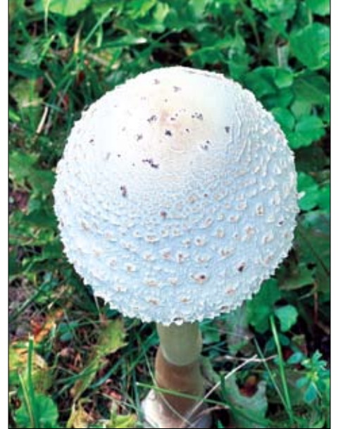
(Clockwise from upper left) Raccoon. Boxelder bug. Poisonous baseball-shaped mushroom and deer in Chicago Forest Preserve.