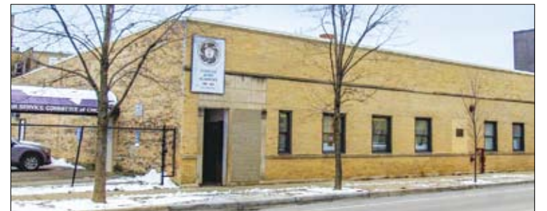
Japanese American Service Committee, 4427 N. Clark St.

JASC will continue operations out of its Uptown location through this summer and has enlisted the