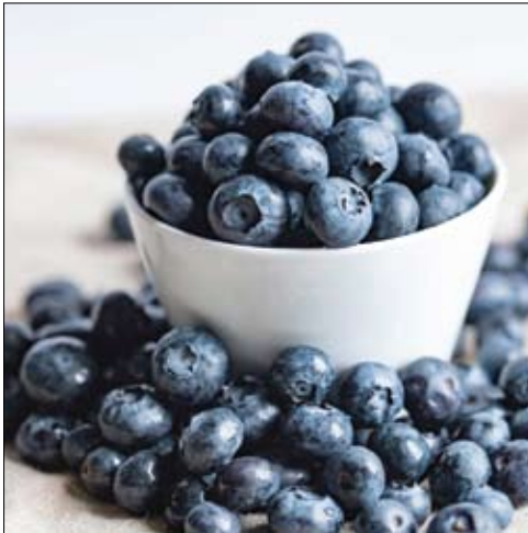
The farmers market blueberries have been consistently sweet and juicy this year.

I also could hear it in the unusual questions visitors were seriously pondering as they ate their lunch on the patio at Ralph Lauren Bar & Grill. They were trying to wrap their minds around our heartbreaking tragedy of leader-