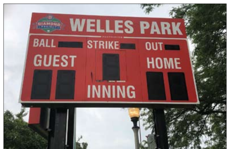
In 2017, three bright red baseball scoreboards suddenly appeared in Welles Park at the beginning of the baseball season, without the knowledge of the local Welles Park Advisory Council.

Lincoln Square German-America Fest kicks off Sept. 10, see page 3