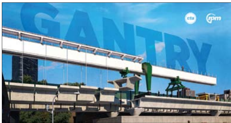
A gantry, like the one pictured above, is a movable construction platform, boom and crane that moves heavy sections of new track, rails and materials along a giant rail into position for assembly.

completely rebuild the line between the Lawrence, Argyle, Berwyn, and Bryn Mawr stations,