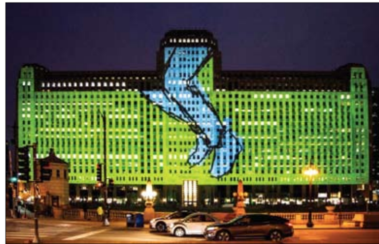
"Footnotes" and Art on theMART play nightly at 9 p.m. and 9:30 p.m. through Sept. 16

Art on theMart's fall season, premiering Sept. 17, will feature the work of concept artist Barbara Kruger in the venue's first solo show.