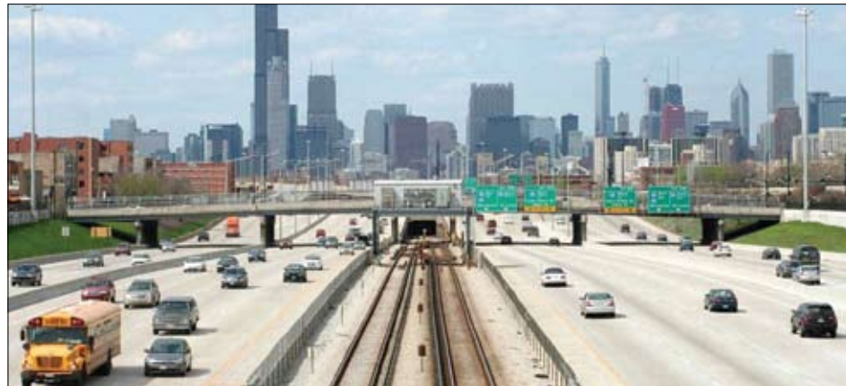
The city and state police are ignoring drivers on the Dan Ryan and Eisenhower expressways who exceed the 55-mph speed limit by more than 50 mph.

In the first two months of Mayor Lightfoot's automated-money grab, some 162 speed cameras, including 69 in “safety zones” within an eighth of a mile of a Chi-