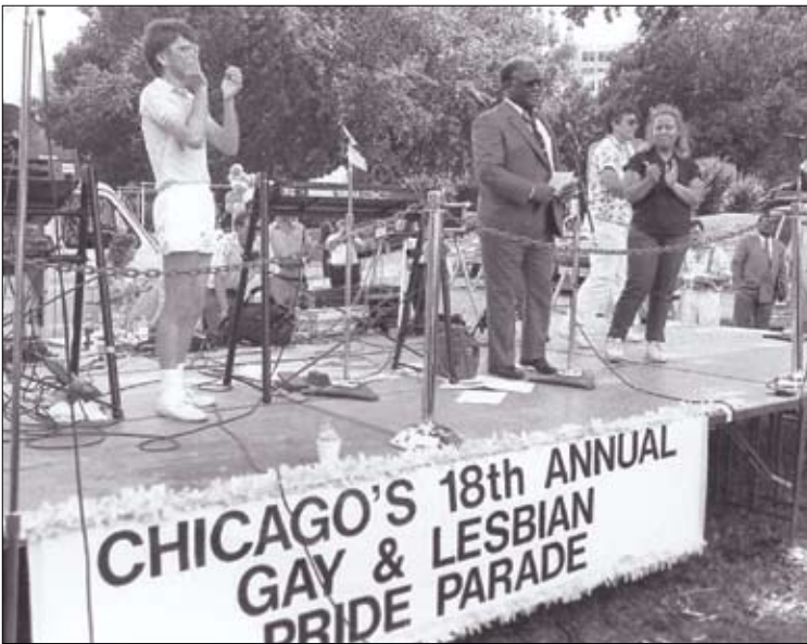
Mayor Harold Washington spoke to approximately 6,000 people who attended the 18th Annual Gay and Lesbian Pride Parade held in Lincoln Park on June 28, 1987.

The LGBTQ legacy of late Chicago Mayor Harold Washington (1922-1987) will be discussed as part of a series of events marking his 100th birthday in 2022. This free event will be 6 to 8 p.m. Wednesday, Oct. 13, at the Center on Halsted, 3656 N. Halsted St.