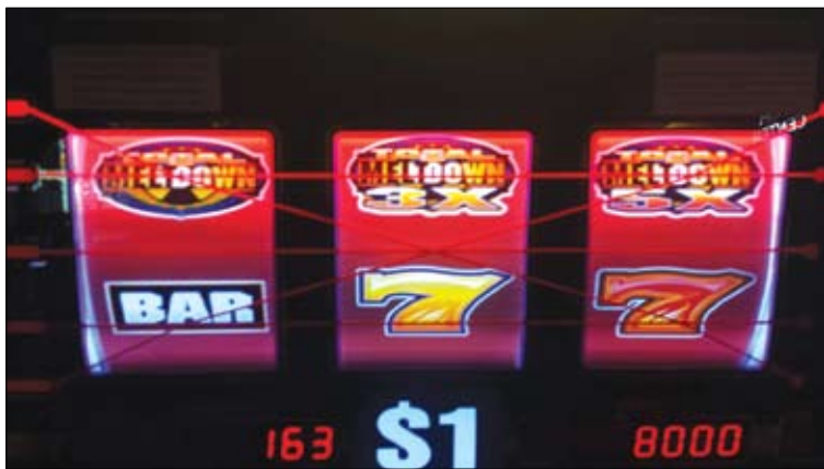
An adaptive reuse of Lakeside Center at McCormick Place as an "instant casino" is a good solution to the state and city's financial crunch because the state and city will not have to wait months or years for a revenue stream from a new-construction casino.

But, Lakeside Center—the original McCormick Place East—is the obvious choice for an instant