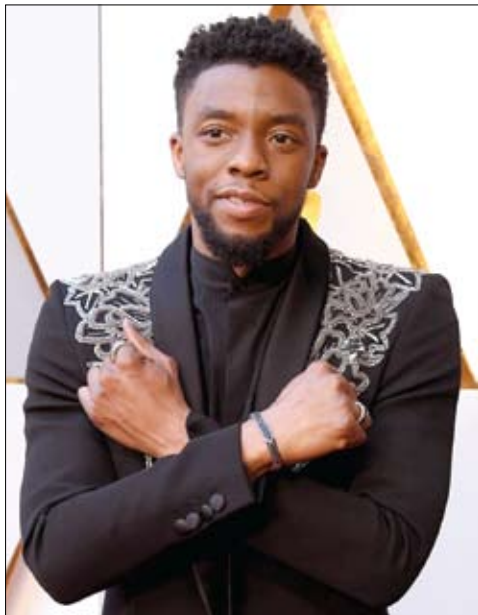
Chadwick Boseman holding the pose associated with the line “Wakanda forever” from the “Black Panther” movie.

But his best-known role was his role as King T’Challa in “Black Panther,” even though Boseman at least once told reporters his greatest pride was playing Thurgood Marshall, the U.S. Supreme Court’s first Black Supreme Court Justice in the film “Marshall.”