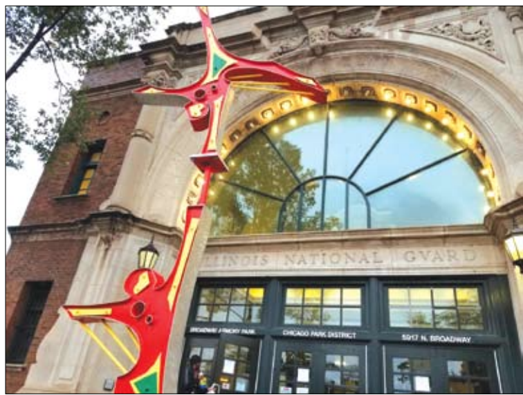
The Broadway Armory at 5917 N. Broadway.