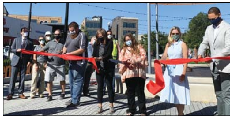
Pedestrian plaza re-opens at Northcenter Town Square.