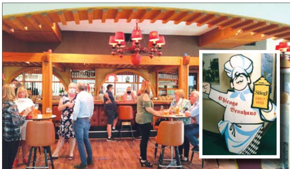
In an earlier era, for 52 years the Chicago Brauhaus served up steins of beer and authentic German food at 4732 N. Lincoln Ave. Their former bar has now relocated around the block into the Dank Haus.

The grand opening of the newly remodeled Chicago Brauhaus Room at the Dank Haus is about ready to happen.