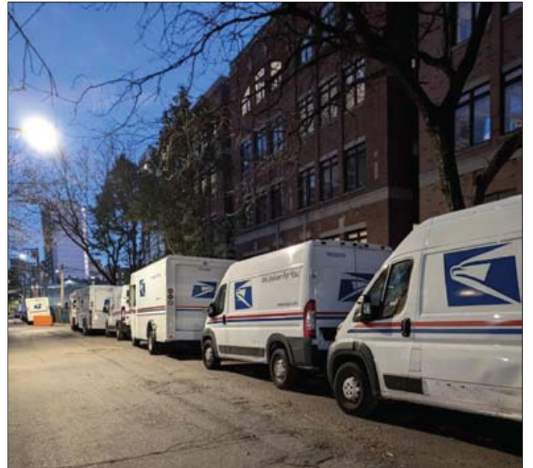
USPS trucks parked on Lehmann Ct. in Lincoln Park

A new seven-story high density building is being built at that former USPS parking lot, which will add even more demand for street parking. The 84-unit building will include only 52 off-street parking spaces for their residents. Before the onslaught of Transit Oriented Development zoning, a