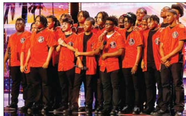
Leo High School Choir