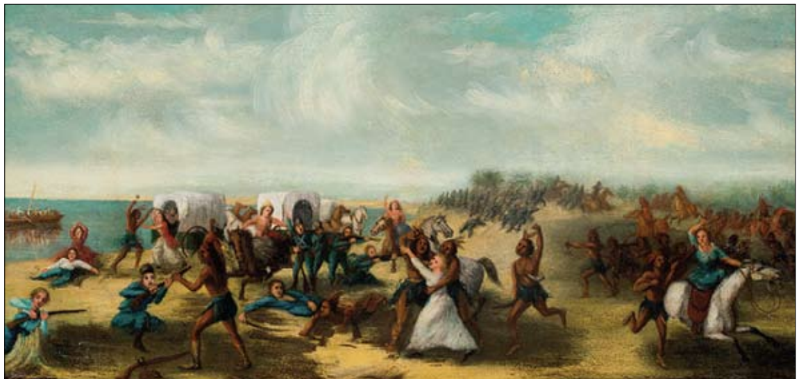
Battle of Fort Dearborn by Samuel Page, also known as the Fort Dearborn Massacre, 1812.

Because Chicago is such a water-world, it also means we are a bridge-world. Could Mayor "Billion Dollar Bust" Johnson order all the city's 300 bridges permanently raised? Not just the