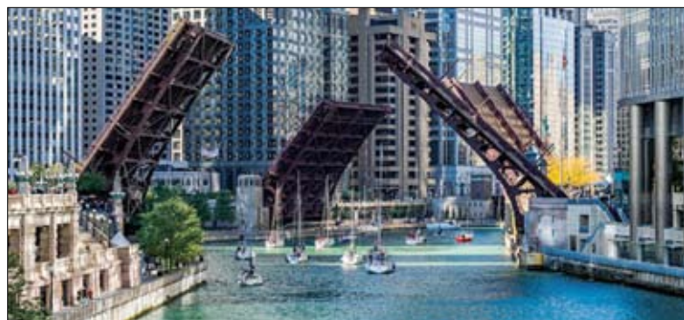
Could Mayor "Billion Dollar Bust" Johnson order all the city's 300 bridges permanently raised?

One thought is urging our hapless mayor to deploy a huge inspection force of his own to go through Trump Towers, floor by