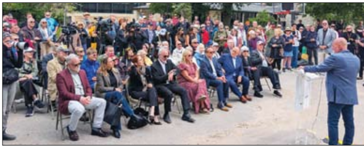
Family, friends and fans gathered Sept. 5 to celebrate Bob Newhart Way.

The Oak Park native’s family moved to the Austin neighborhood on Chicago’s West Side