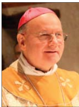
Archbishop Domenico Sorrentino of Assisi

To learn more about the event, visit lpzoo.org .