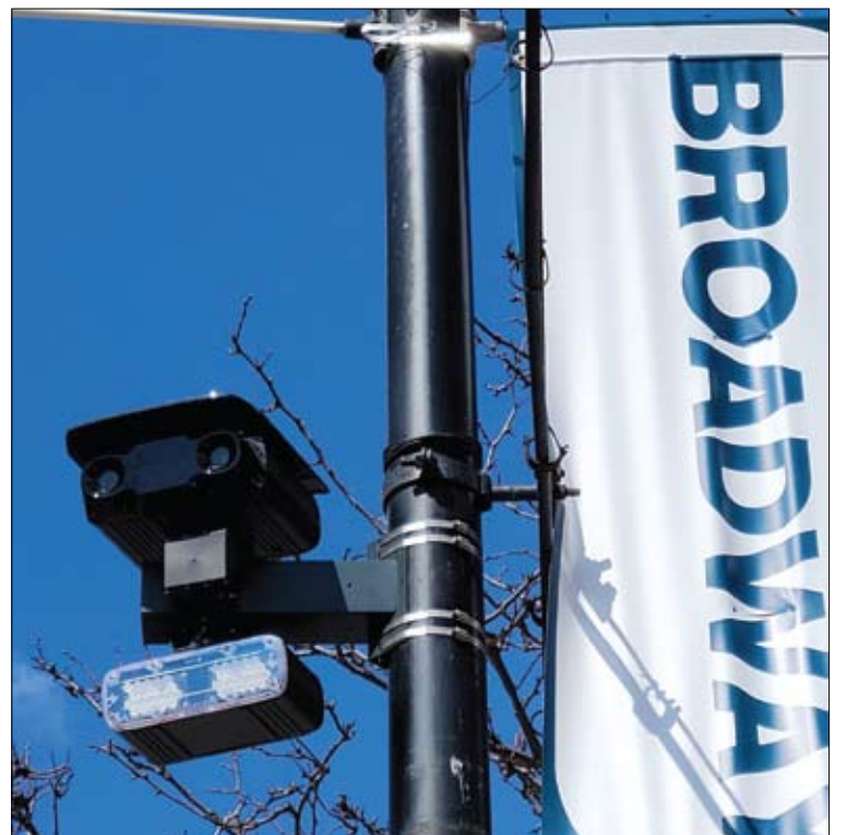
Speed camera adjacent Broadway Armory Park.

In a city remarkably adrift in red ink, Chicago city planners ap-