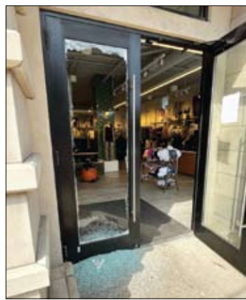
Smash-and-grab burglars raided Lululemon, 3556 N. Southport, on Sept. 5.

In Lakeview, four people broke into Lululemon, 3556 N. Southport, by smashing through the front door around 3:28 a.m. They took merchandise and escaped in a silver Audi Q3 that has been playing cat and mouse with cops on the North Side this week, an officer said. The crew keeps chang-