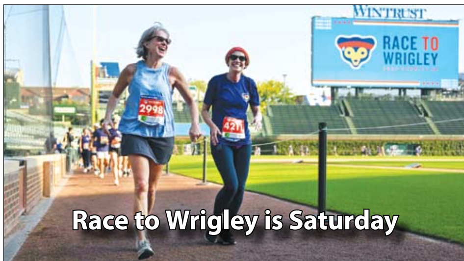
Race to Wrigley is Saturday