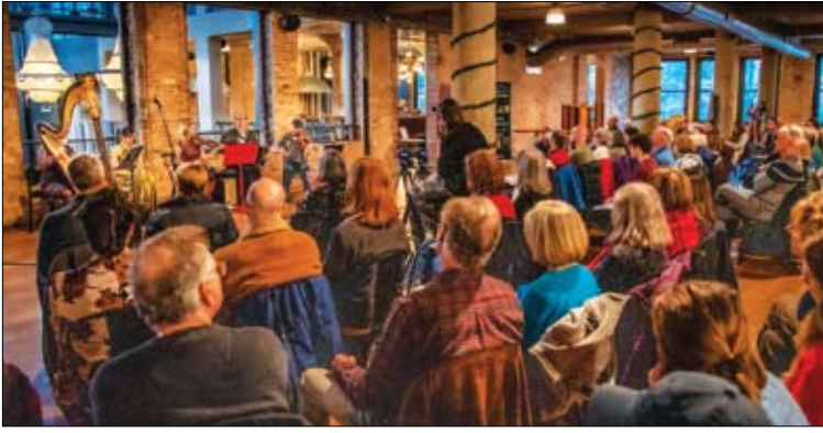
Entering its fifth season, Rendezvous Arts offers a seven-concert series, repeating each event at distinct venues in Ravenswood, Lake Forest, and Dixon, IL. Their next event is this coming Saturday.