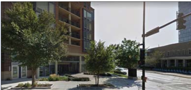
The victim was found behind the apartment building at left. At right is the 18th District police station.

Police and residents reported hearing shots fired at 12:13 a.m. in the 500 block of West Division Street. The shooting victim was found minutes later in a corridor behind an apartment complex at 545 West Division Street, police said. He was unresponsive and bleeding