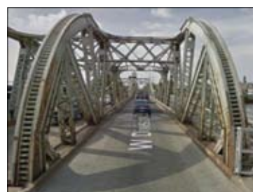
The Division Street Bridge is a riveted steel, double-leaf bascule bridge scheduled for demolition and replacement in 2020.

R2 published an ambitious conceptual master plan in 2015 called Goose Island Vision 2025 which envisioned a Blackhawk