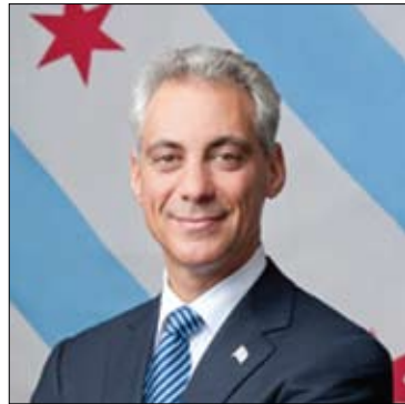
Mayor Rahm Emanuel

• Downtown development. Emanuel will leave office while the city's real estate market is booming and developers are breaking ground on a plethora of billion-dollar skyscrapers and res-