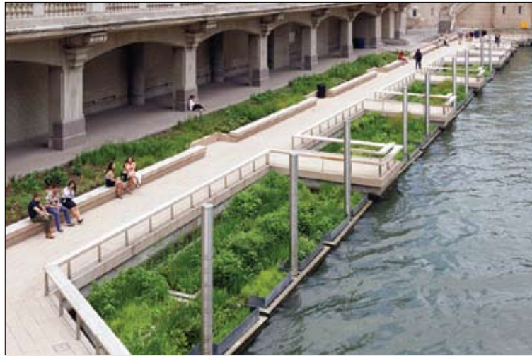
Floating gardens are located along the Chicago Riverwalk between LaSalle and Wells streets.