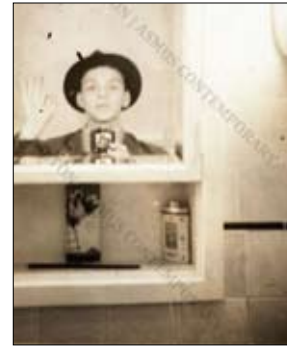
"Selfie" in the medicine cabinet. An early self portrait of Frank Sinatra taken at his home in Hoboken, New Jersey, in the late 1930s.

A: Yes. My grandfather was very much a family man and loved to spend time with us. He wanted to be with his family and always wanted us around, which included all the immediate family. We spent time with him in New York (where he had an apartment), Philadelphia and Atlantic City. Most of the time was spent with him in Palm Springs or Las Vegas. During the school year we'd take road trips to Palm Springs and Vegas just for the weekend because he wanted us there. He went out of his way on the weekends to spend time with us. He loved being