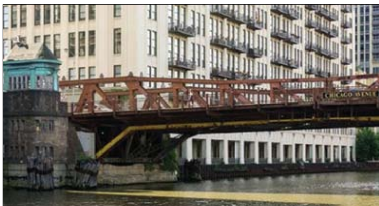
The Chicago Avenue Bridge is scheduled for demolition this month.