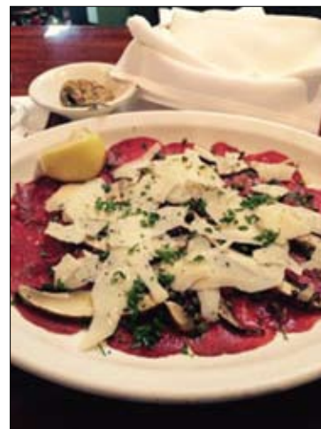
Carpaccio of beef

Imagine the cook who first ground together fresh basil leaves, garlic, pine nuts and grated cheese and mixed in good olive oil and tasted pesto sauce for the first time? Or the cook who first blended cream, butter, egg yolks and cheese, tasting Alfredo sauce at its birth? I'd like to think that the ancient Romans had their fingers in these activities as much as the erudite elites of Italian Renaissance society. The perfect blend of imaginative creativity and common sense. The mix of well-known ingredients in ever new and pleasing ways. Or what must it have been like when the first whole head of garlic was roasted, mashed and spread on crunchy Roman bread? Image the cheese caves outside of Milan (today merely suburbia) in the village of Gorgonzola, when cheese curd was first aged in those caves to the gastronomic heights found in that rich namesake blue cheese? Who imagined making a small purse of dough and then stuffing it with cheese and meat, creating the perfect ravioli?