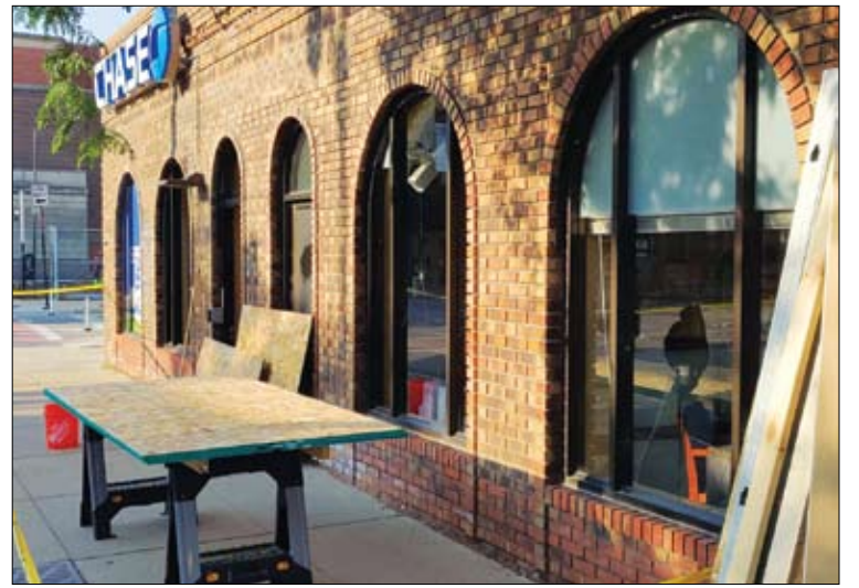
Chicago police responded to a call of an explosion at the Chase Bank, 5134 N. Clark. The explosion turned out to be smoke bombs tossed into the building while it was being attacked by a mob of radical activists.