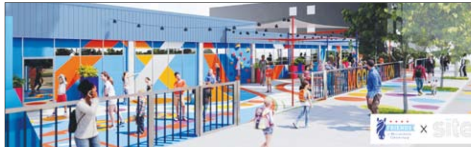
The goal is to complete construction at the McCutcheon School during the summer break of 2024. Friends of the school are working now to raise $600,000 for the initial cost and maintenance of the new playground.

The goal is to complete construction during the summer break of 2024. And they are working now to raise $600,000