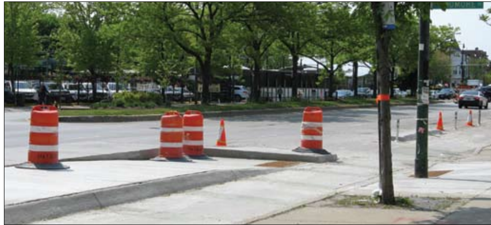
Chicago's streets are being inundated with concrete barriers to provide privileged access to bike and scooter riders, only these vehicle and bus obstacles may have been built without taking into consideration wheelchair users or others living with limited mobility, and are out of compliance with the federal Americans with Disabilities Act [ADA]. Photo at left is on the 2400 Block of W. Belmont and at right the 5900 Block of N. Clark St.