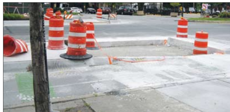
This newspaper placed numerous calls and sent emails to the spokesperson for the Chicago Dept. of Transportation regarding apparent non-compliance with the federal ADA regulations, but no one from that agency has yet responded.