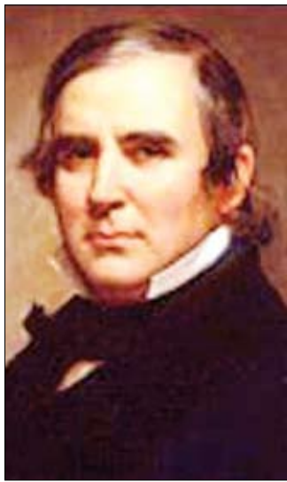
Mayor William Butler Ogden