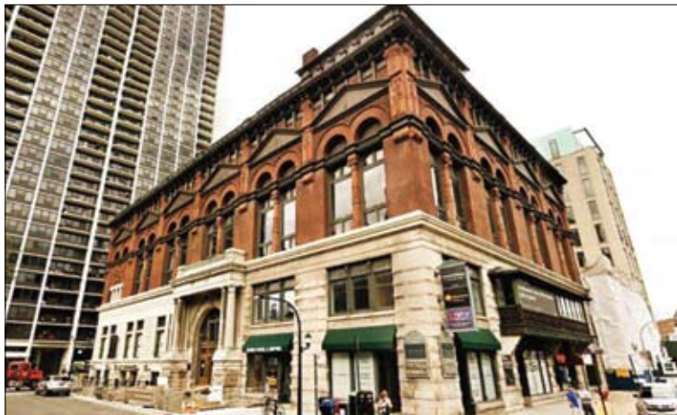
108 W. Germania Pl. in Old Town.

Developer’s private communications with Deputy Mayor shed light on pending gift of Lincoln Square parking lot, page 3