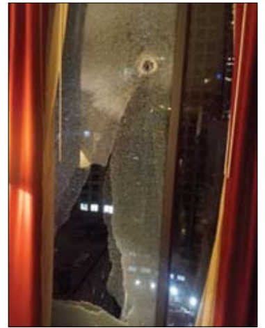
Bullet-riddled window of Gold Coast hotel.