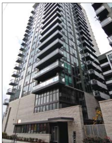
The downtown apartment vacancy rate has rebounded to 94.5% in 2021

In 2020, the pandemic, riots and social unrest practically shut down the downtown condo market creating an over-supply of listings. However, Realtors say in 2021 there still are bargains to be had because prices have not yet reached pre-pandemic