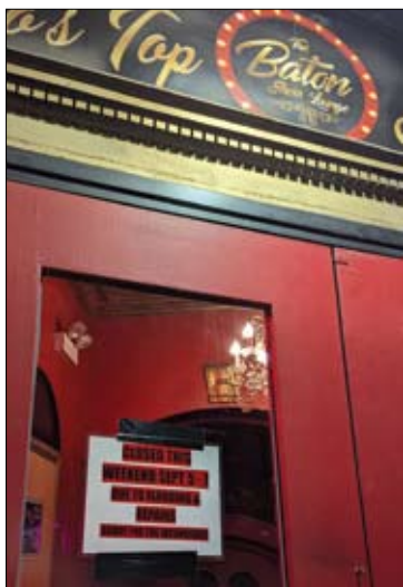
The Baton Show Lounge in Uptown is temporarily closed for renovations due to a recent flooding event.

From our observation, it appears that water could have rushed down an open drainpipe, onto the ground, and into the adjacent building's basement. It appears at the time of the storm, that