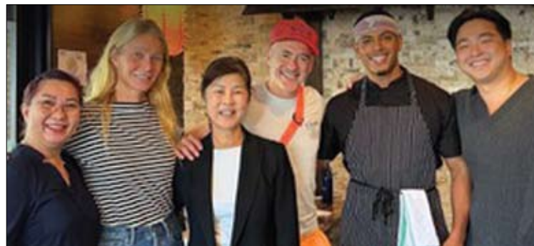
Gwyneth Paltrow (second from left) and Robert Downey Jr. (fourth from left) pose with TenGoku Aburiya staff.

food items at the Nourishing Hope tent upon entry.