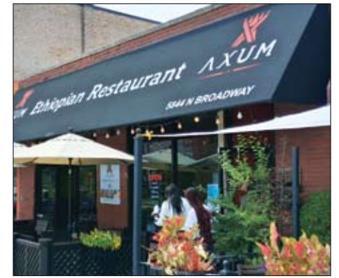
Axum Ethiopian Restaurant, 5844-46 N. Broadway.

shows the On-Premises Consumption [state liquor license] is currently expired as of Sep. 13, 2025. The license expired on Aug. 31.