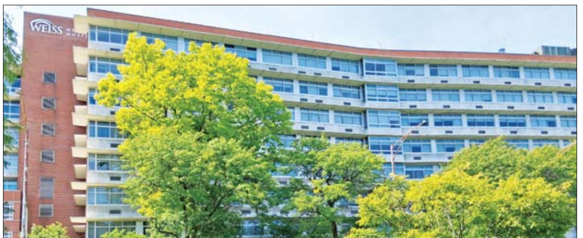
The now shuttered Weiss Memorial Hospital in Uptown.