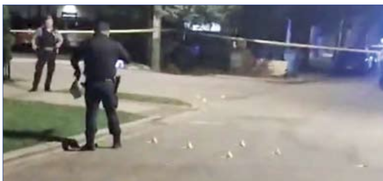
Evidence markers lie next to shell casings as police investigate a shooting in the 2000 block of W. George St. on Sept 11.

But the victim wasn't there. He had already been driven to Advocate Illinois Masonic Medical Center, where he walked in with a gunshot wound to his abdomen. According to a CPD statement,