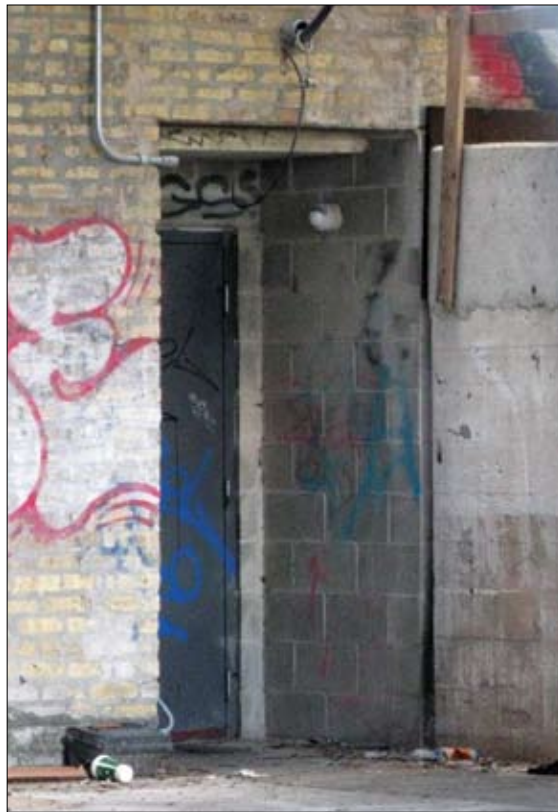
The downspout gutters (left) leading from the Red Line end four feet above the ground and may be responsible for flooding that closed the Baton Show Lounge in Uptown, whose back door (right) was adjacent to the gutter.