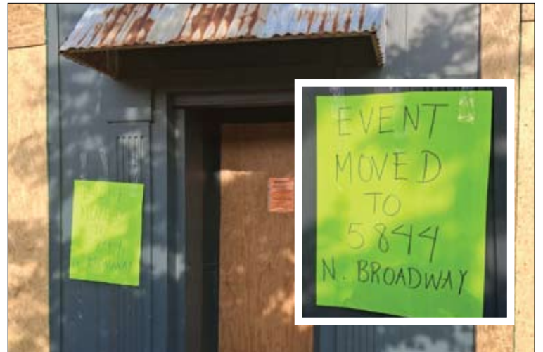
Signs outside the fire-gutted Porkchop Restaurant on Broadway.

The "event" referenced on the sign at Porkchop Restaurant may refer to late night music events now relocated to Axum Restaurant. A previous event led to the