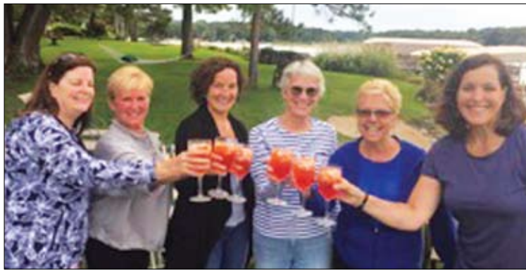
Aperol Spritz toasts all around.

Heirloom tomatoes create the flavored abundance of the hot months. They are to be cherished and savored. My mother loved to