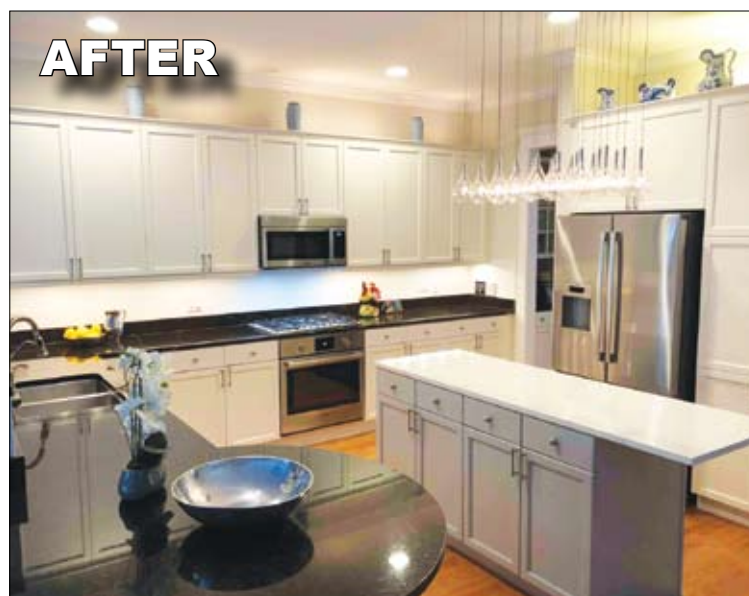
The retail price of an "affordable" kitchen rehab ranges from $30,000 to $40,000.

thrifty homeowner should consider wise alternatives that can slice this hefty bill in half if you act as your own general contractor.