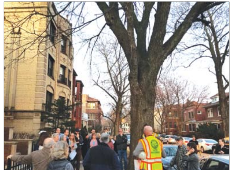
The search is on for the city to try and find a way to do sewer and water work that will not damage the oldest and tallest the trees on the block.