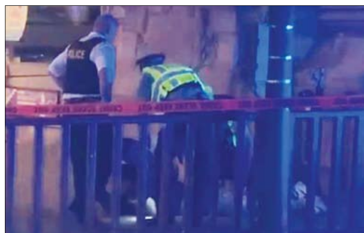
Chicago police officers tend to a victim after two people were shot on the south side of the Michigan Ave. Bridge on Sept. 14.

Aldermen, residents continue fight to keep gunshot-detection system, page 5