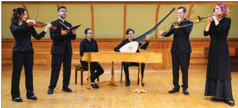
The Newberry Consort shines a spotlight on the Jacobean Era with its music from Jacobean England.

The Loop concert is 4 p.m. Oct. 20, at Ganz Hall at Roosevelt Univ. Tickets are $45 for general seating, $65 for reserved