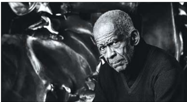
Richard Hunt, one of America's foremost African-American sculptors, was a lifelong Chicagoan, with strong roots to the city.

Though Hunt was celebrated in his lifetime, including with a large survey at the Museum of Modern Art in 1971 when he was just 35-years old, his 70-year career has still flown beneath the radar. Part