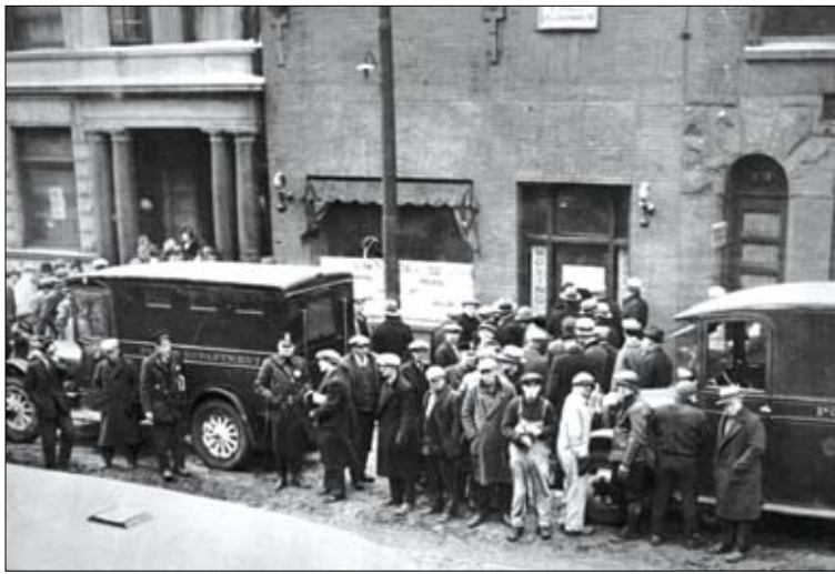
Curious neighbors mill about at the site of the St. Valentine's Day massacre on Clark St. in Lincoln Park.