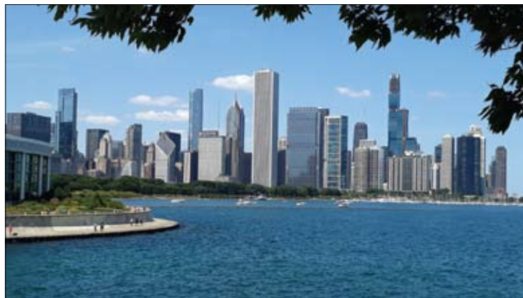
The North Side has posted "surprisingly robust" real estate values.