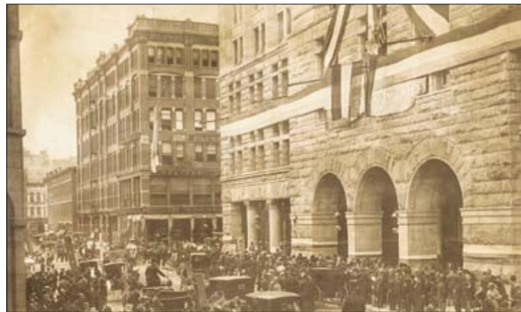
A rarely seen albumen print of Adler and Sullivan's partially completed Auditorium Building (theater entrance) taken during the 1888 National Republican Convention where Benjamin Harrison was nominated as presidential candidate.